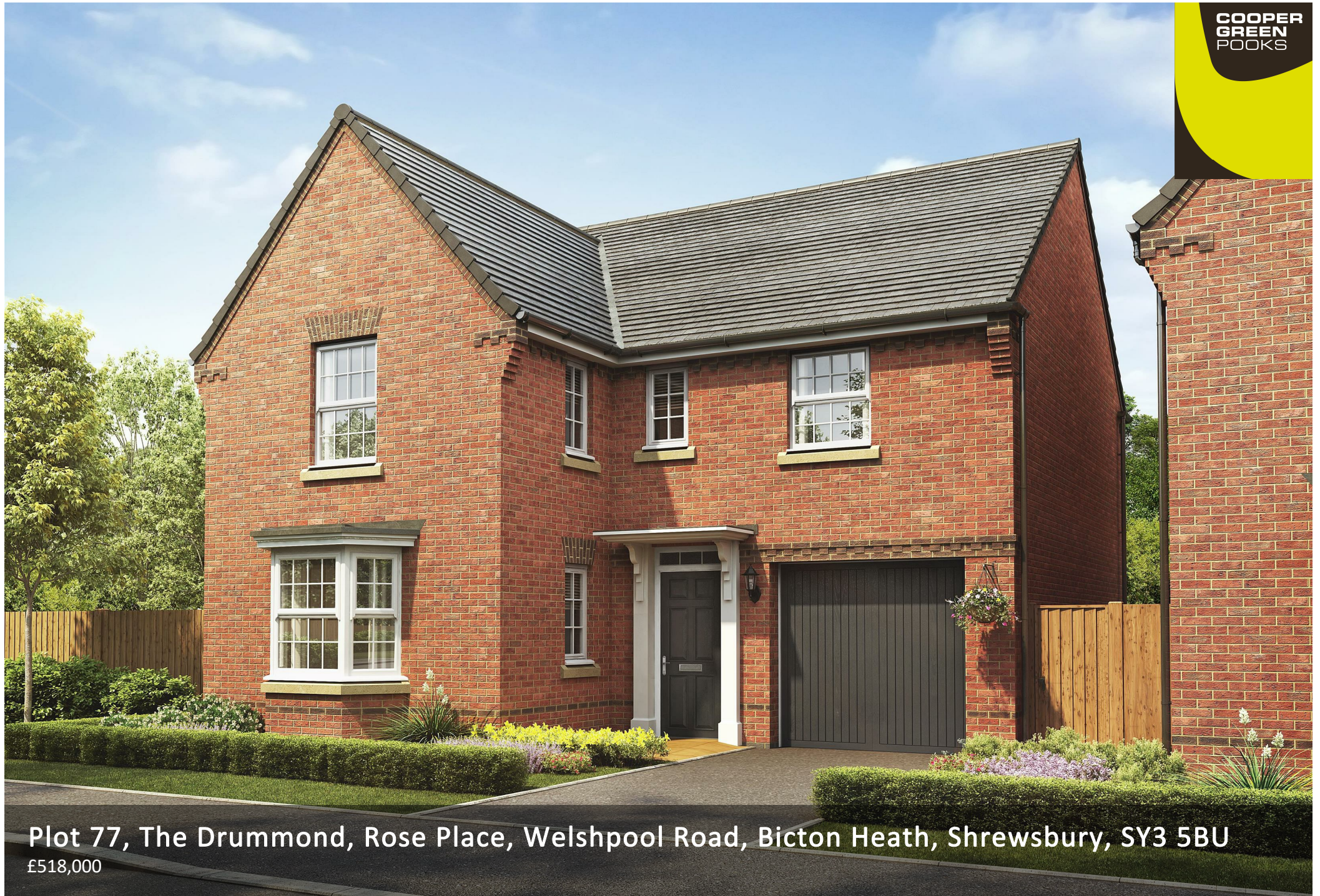
Plot 77, The Drummond, Rose Place, Welshpool Road, Bicton Heath, Shrewsbury, SY3 5BU £518,000