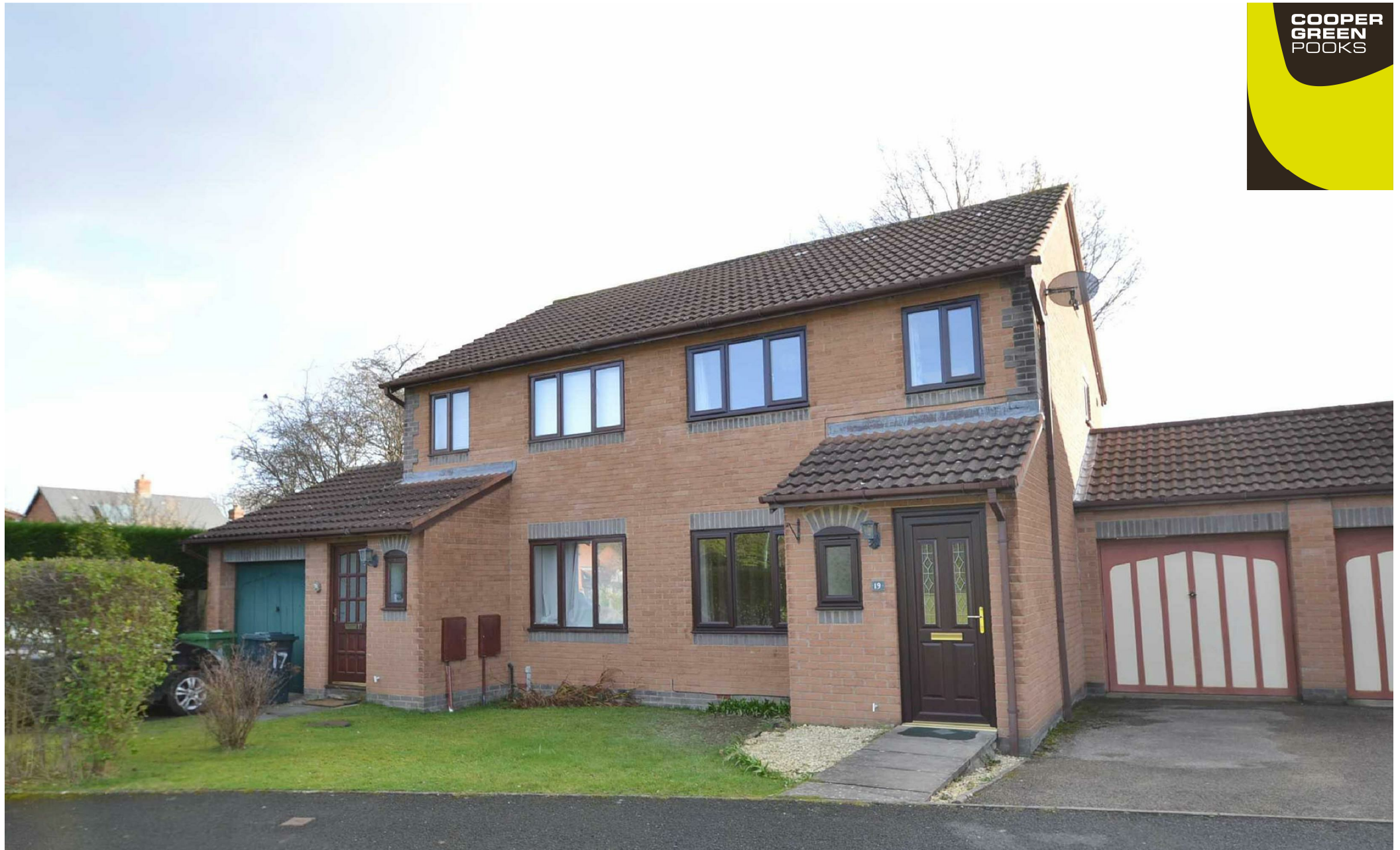
19, Lambourn Drive, Bicton Heath, Shrewsbury, SY3 5NE £995 Per Month