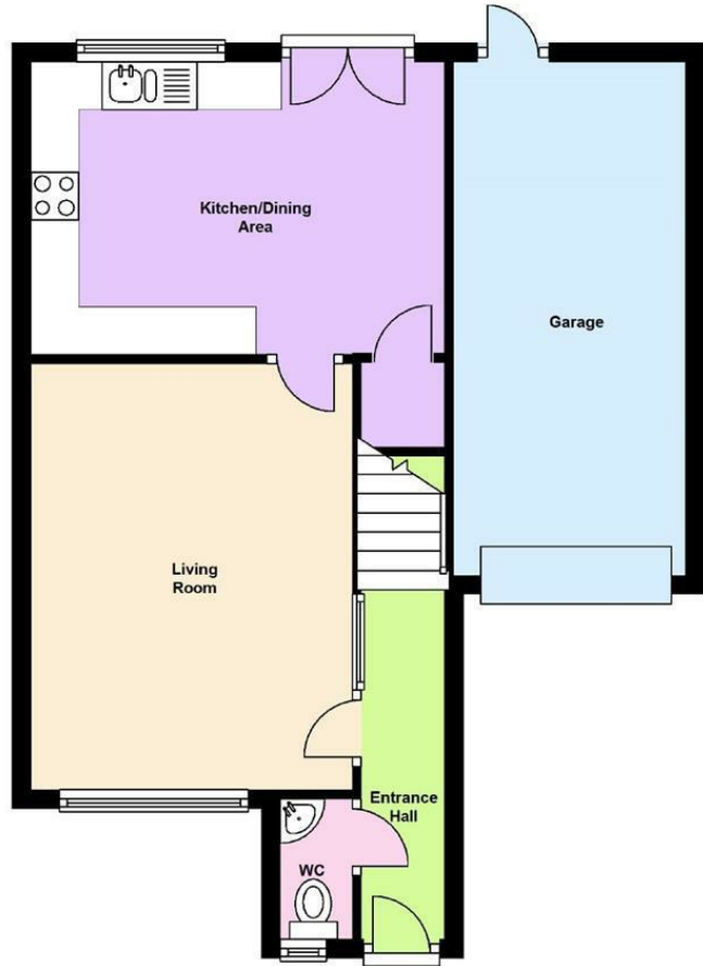
Ground Floor Approx. 49.4 sq. metres (531.2 sq. feet)