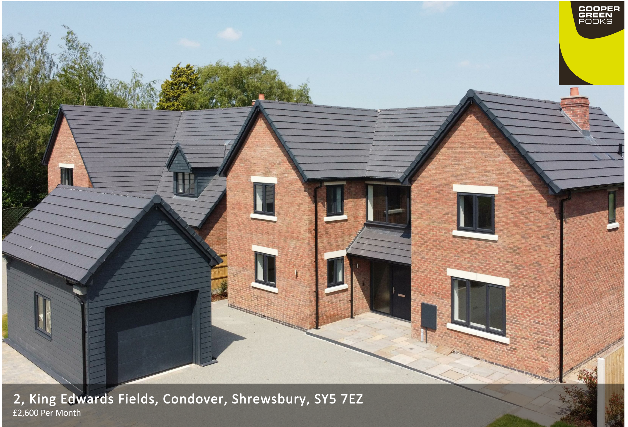
2, King Edwards Fields, Condover, Shrewsbury, SY5 7EZ £2,600 Per Month