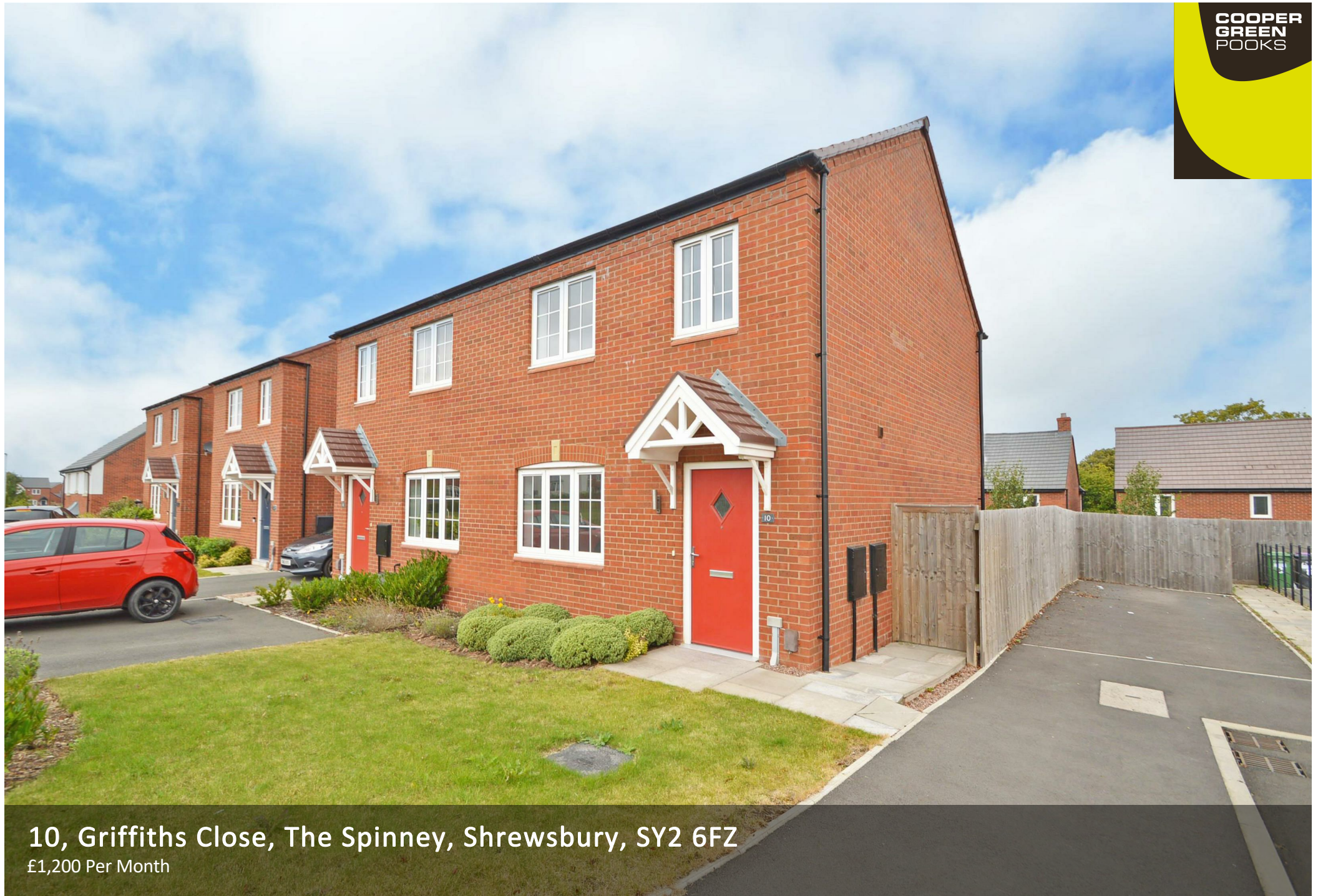
10, Griffiths Close, The Spinney, Shrewsbury, SY2 6FZ £1,200 Per Month