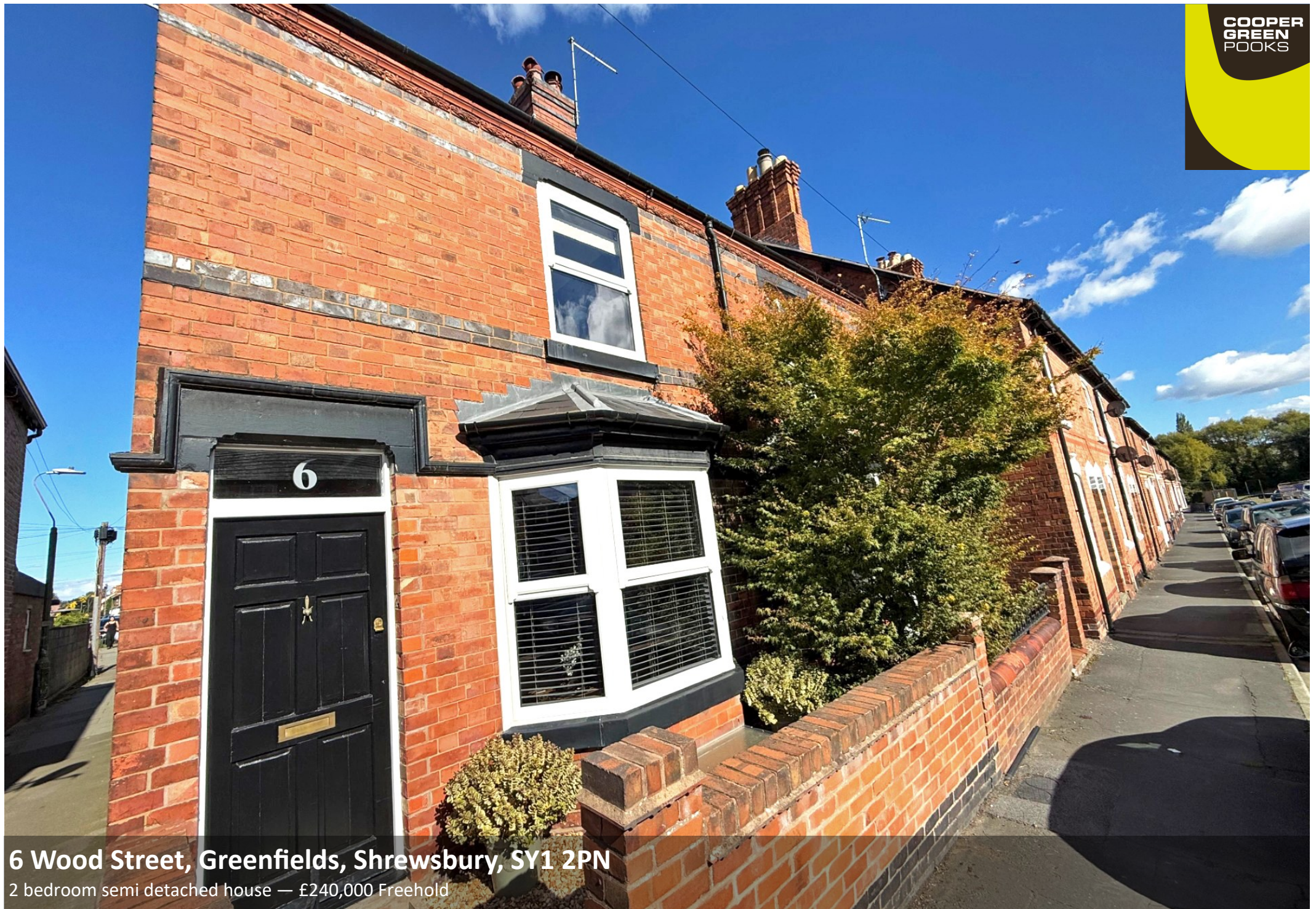
6 Wood Street, Greenfields, Shrewsbury, SY1 2PN

2 bedroom semi detached house — £240,000 Freehold