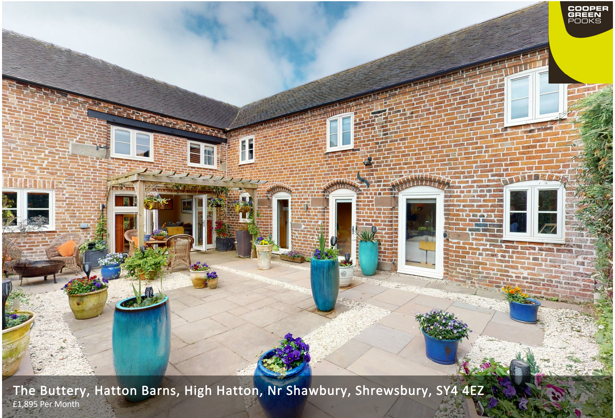
The Buttery, Hatton Barns, High Hatton, Nr Shawbury, Shrewsbury, SY4 4EZ £1,895 Per Month