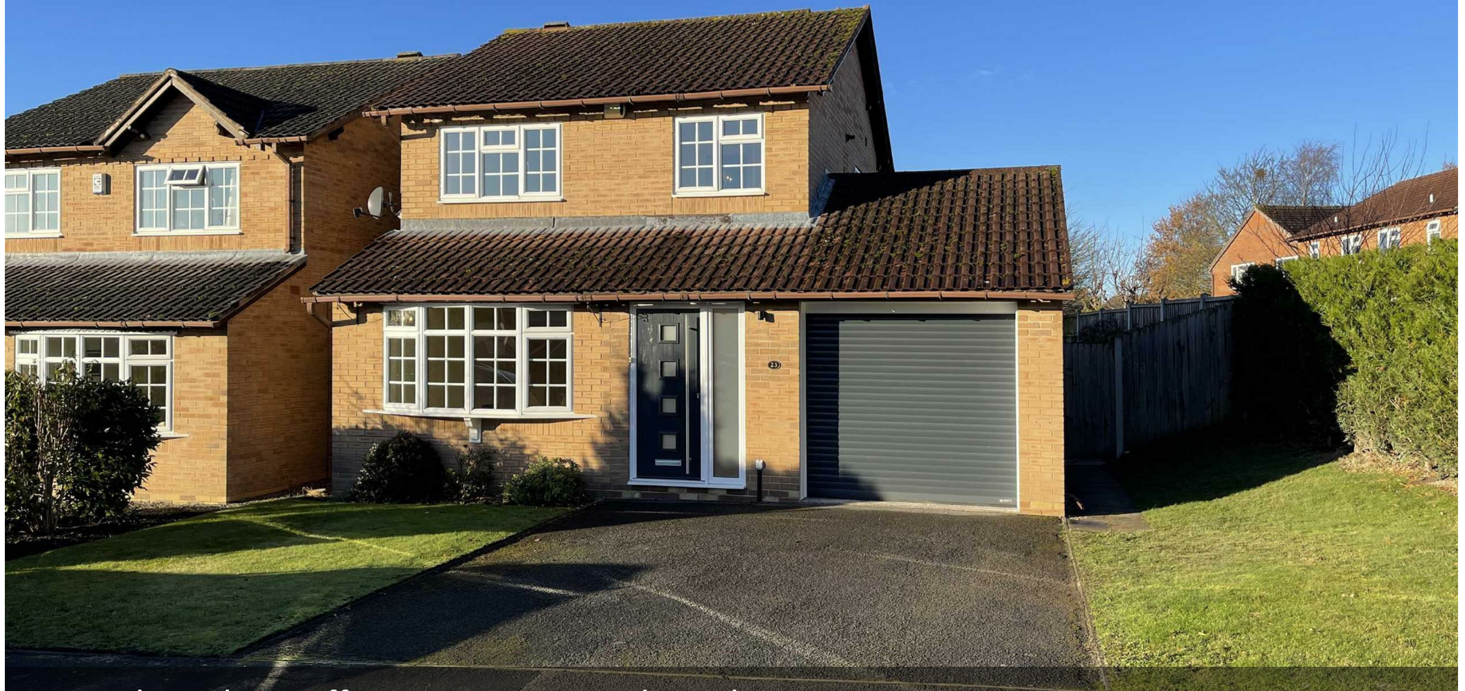
23, Carlton Close, Off Racecourse Lane, Shrewsbury, SY3 5JA £1,250 Per Month