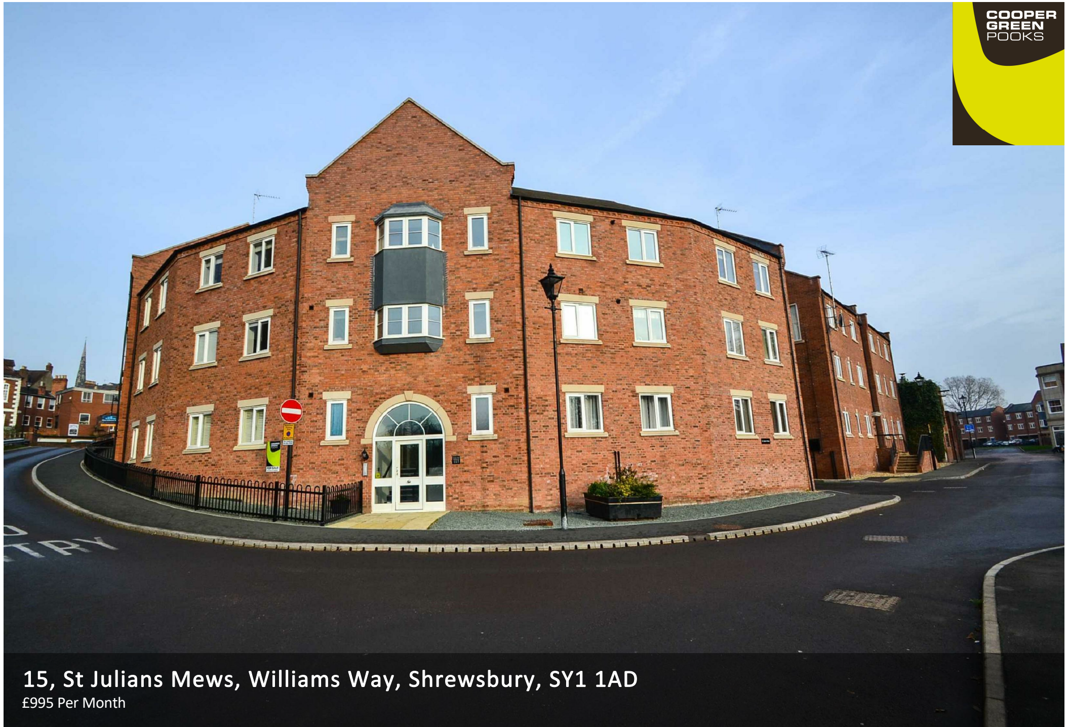
15, St Julians Mews, Williams Way, Shrewsbury, SY1 1AD £995 Per Month