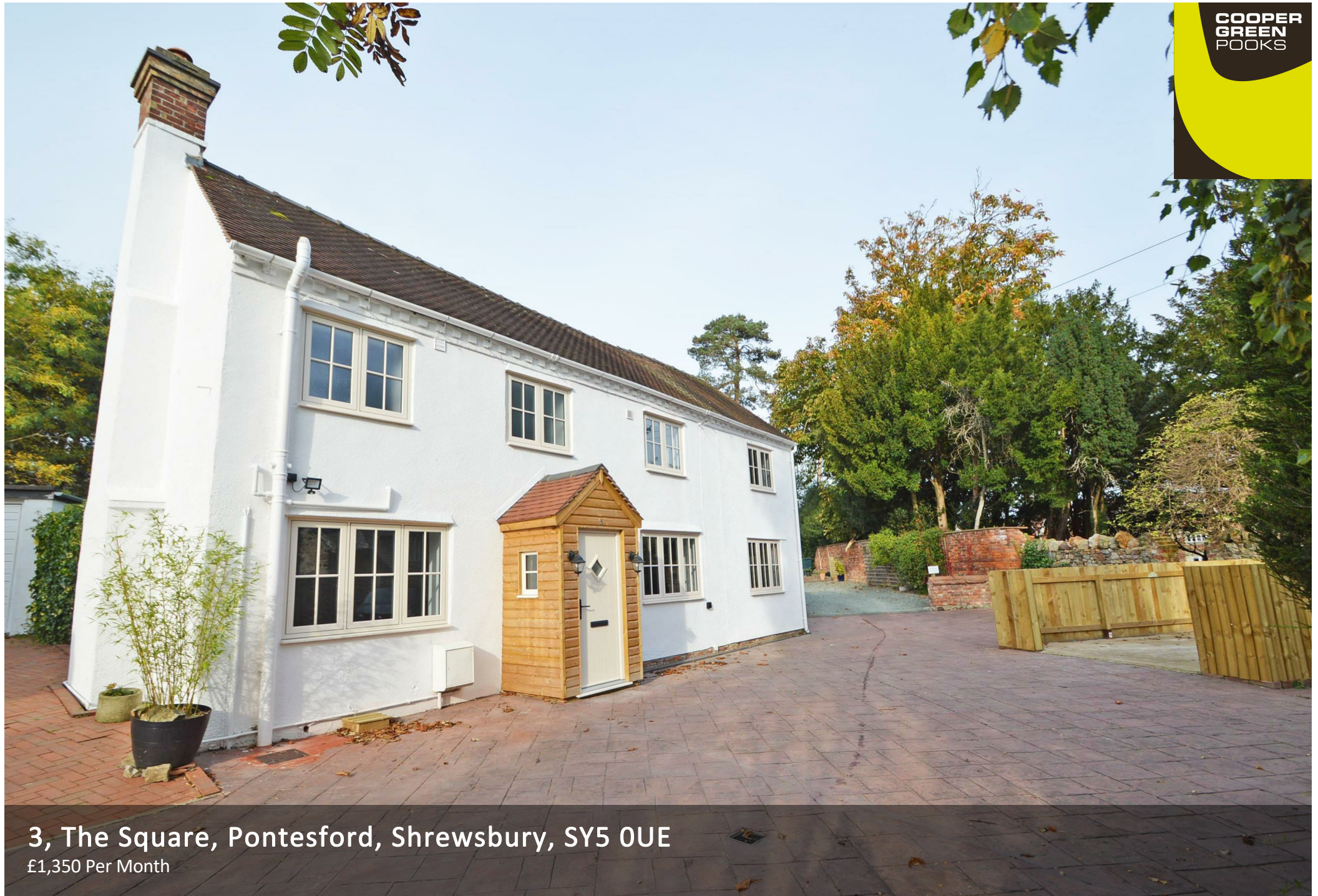
3, The Square, Pontesford, Shrewsbury, SY5 0UE £1,350 Per Month