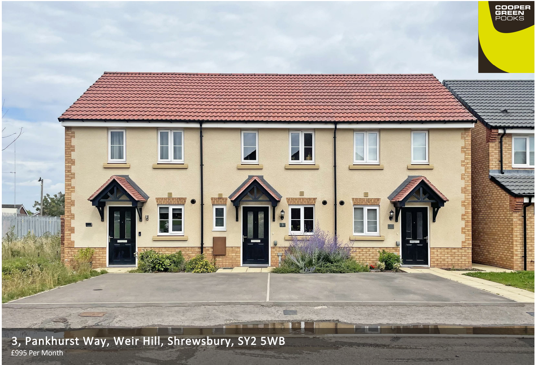
3, Pankhurst Way, Weir Hill, Shrewsbury, SY2 5WB £995 Per Month