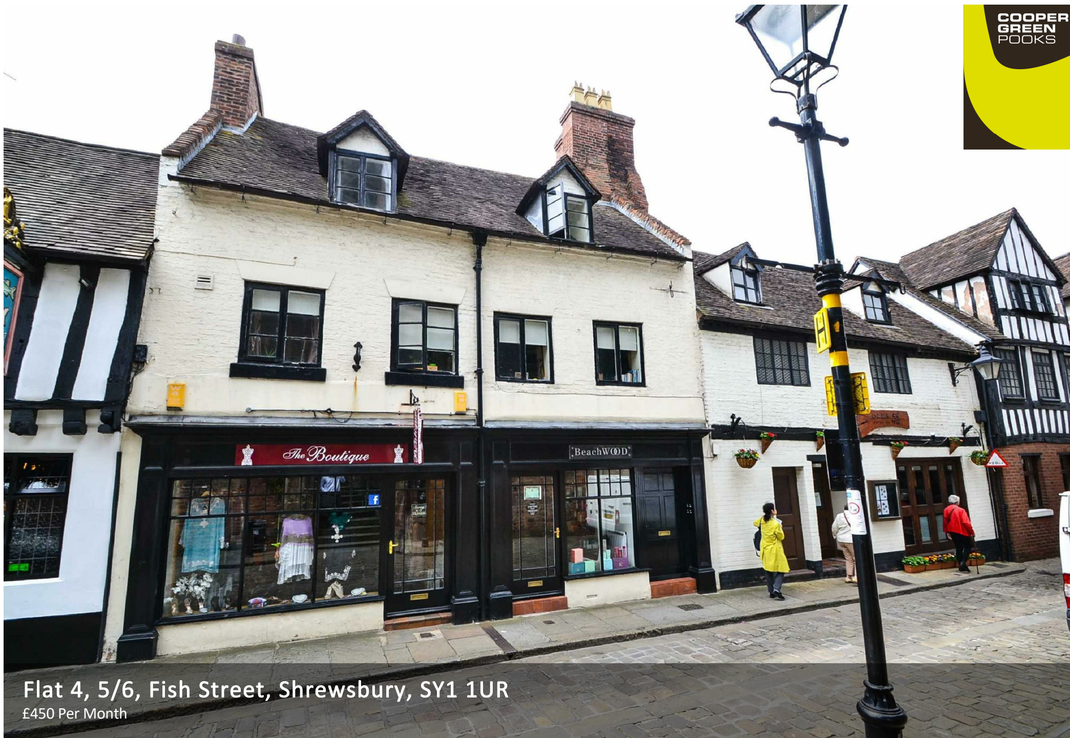
Flat 4, 5/6, Fish Street, Shrewsbury, SY1 1UR £450 Per Month