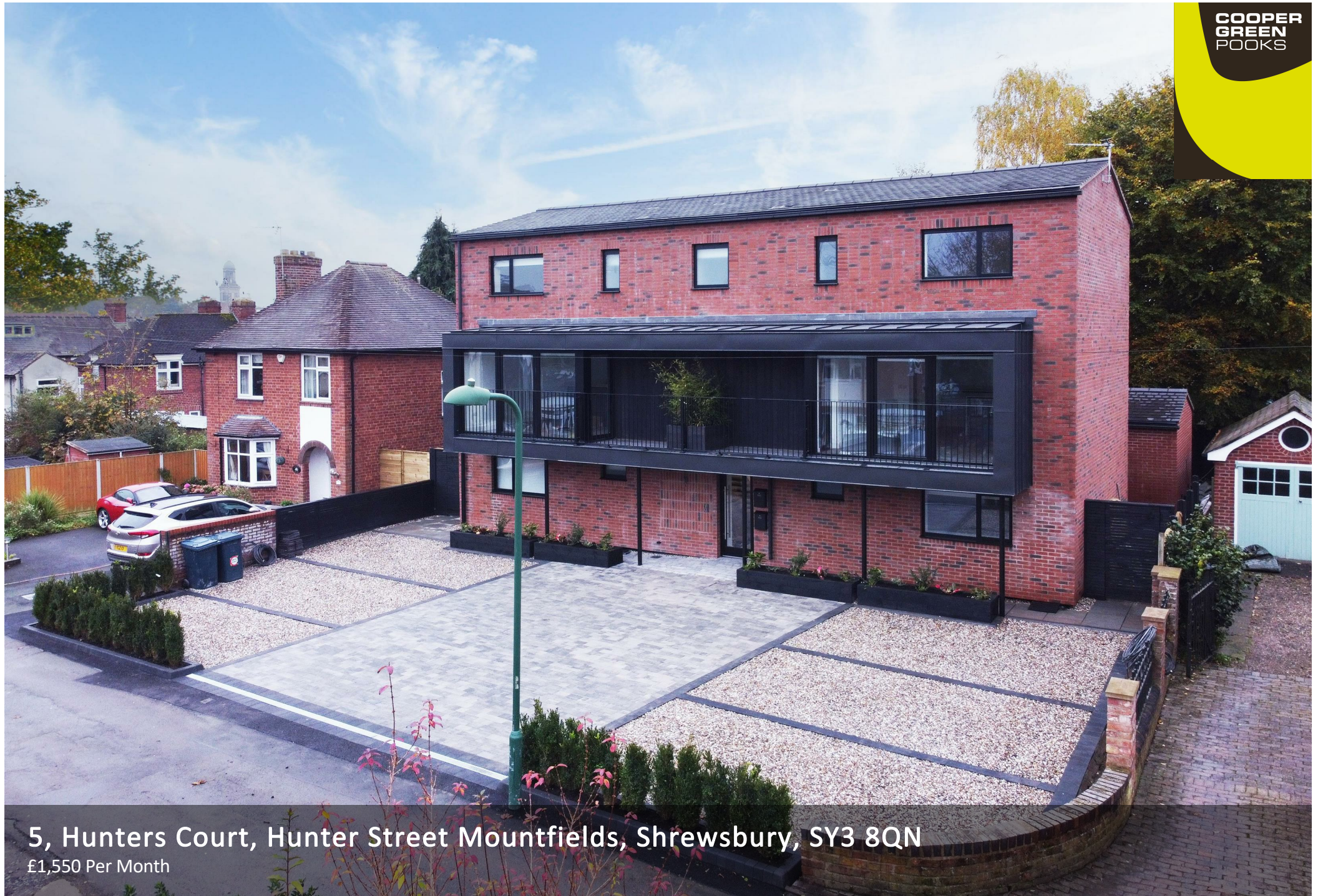
5, Hunters Court, Hunter Street Mountfields, Shrewsbury, SY3 8QN £1,550 Per Month