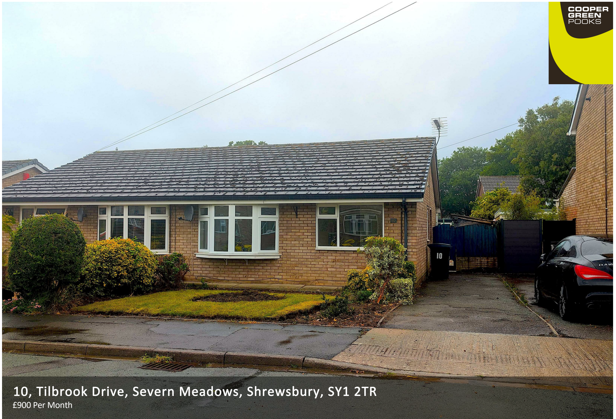
10, Tilbrook Drive, Severn Meadows, Shrewsbury, SY1 2TR £900 Per Month