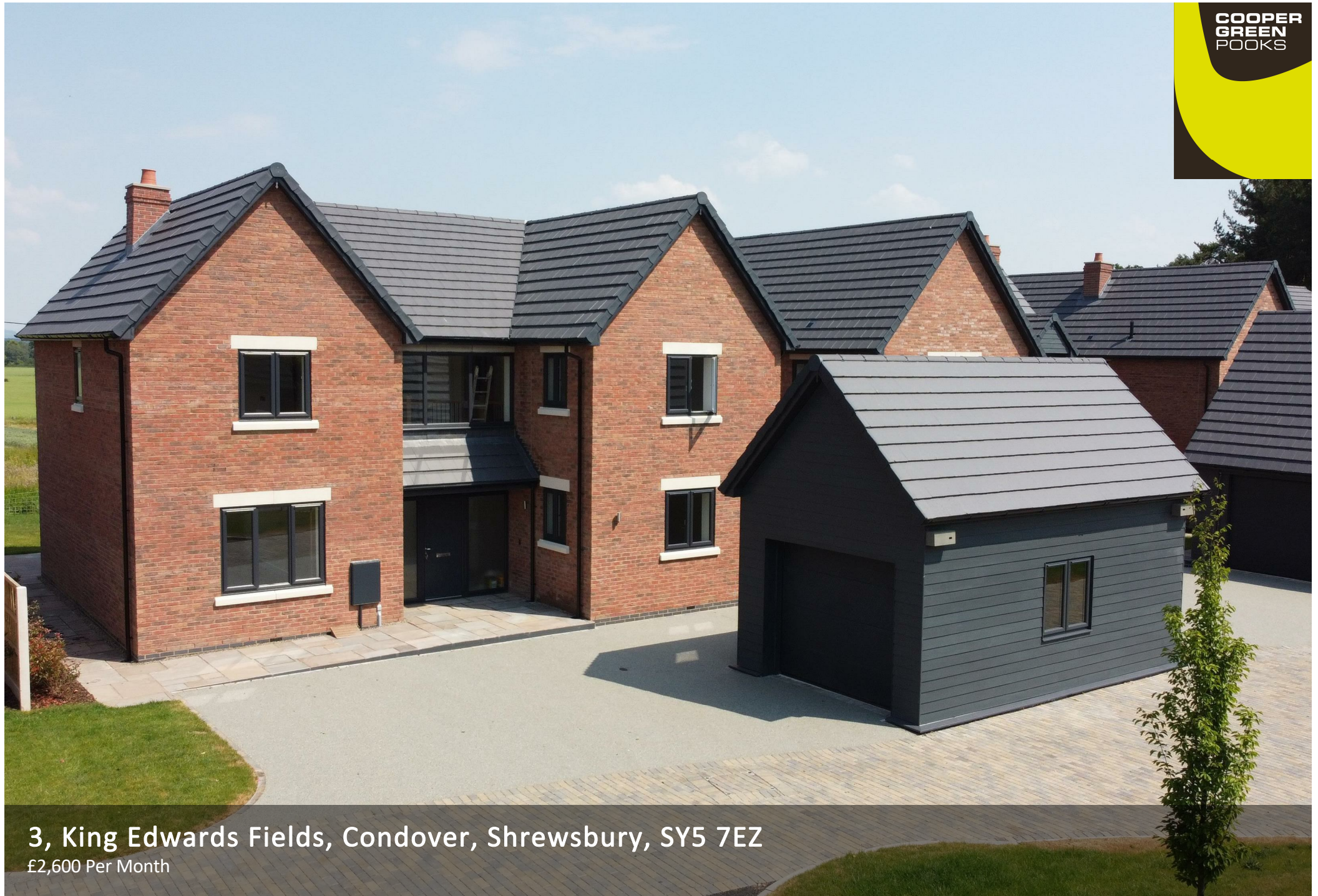
3, King Edwards Fields, Condover, Shrewsbury, SY5 7EZ £2,600 Per Month