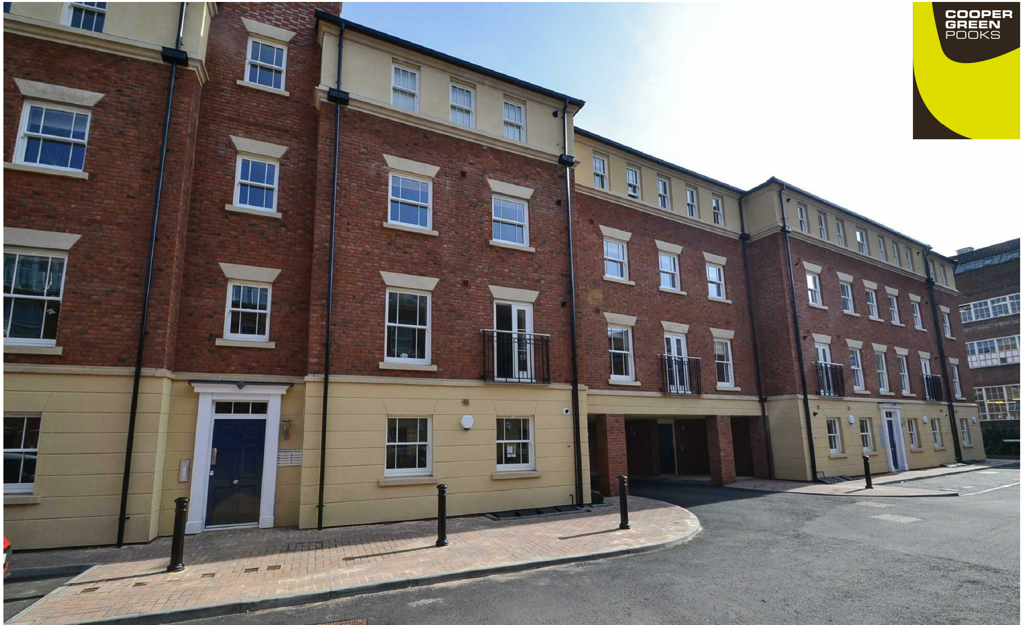
76, The Old Meadow, Abbey Foregate, Shrewsbury, SY2 6GA £950 Per Month