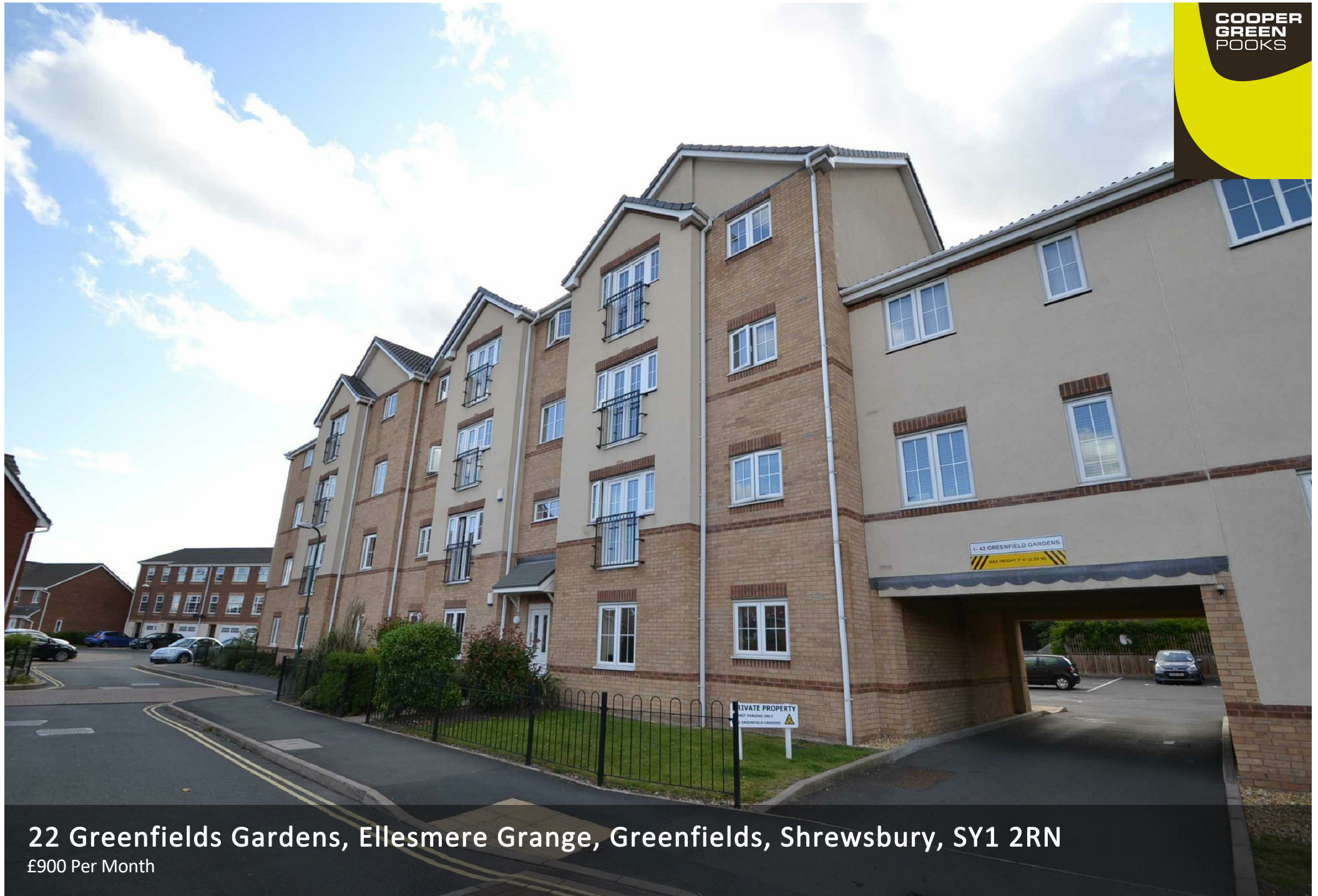
22 Greenfields Gardens, Ellesmere Grange, Greenfields, Shrewsbury, SY1 2RN £900 Per Month