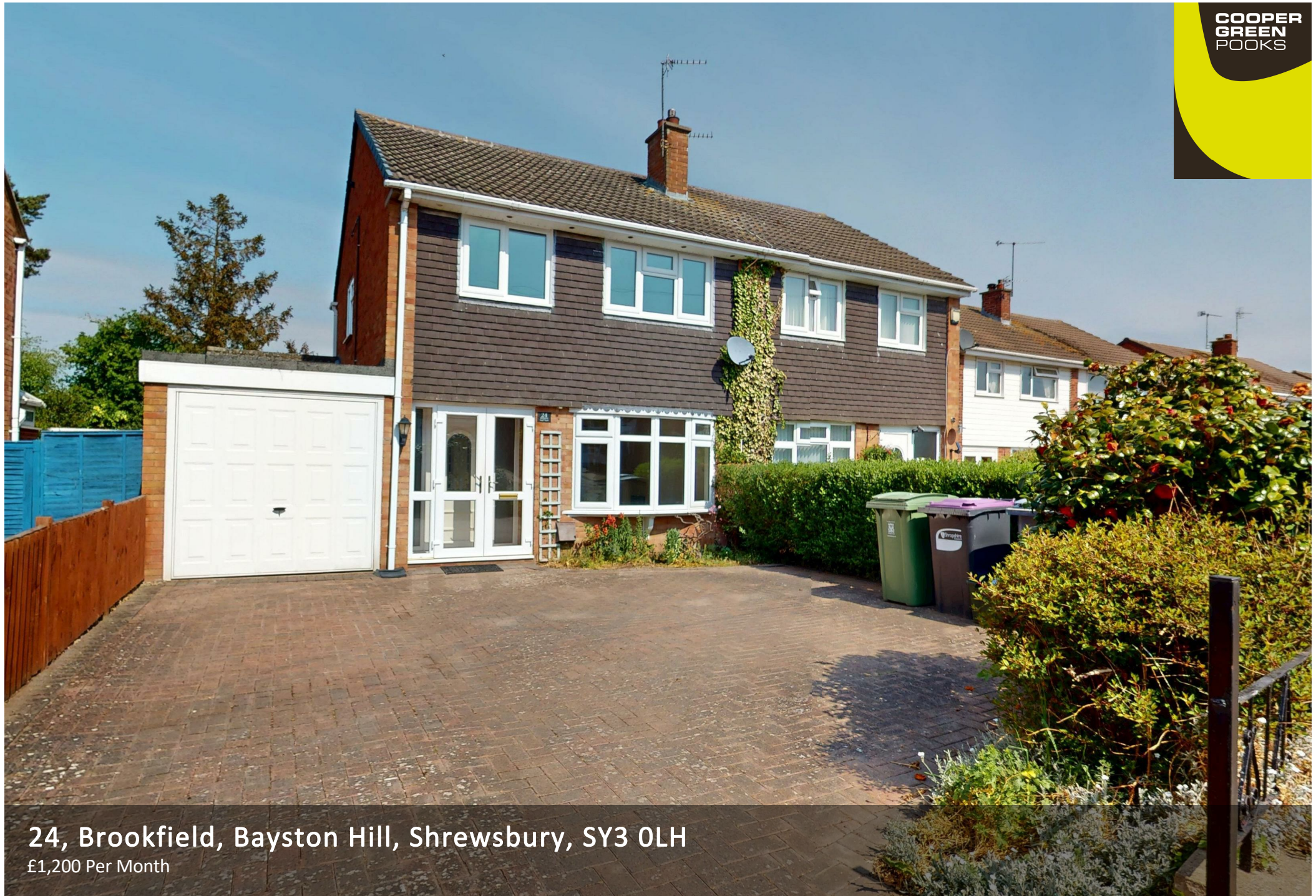
24, Brookfield, Bayston Hill, Shrewsbury, SY3 0LH £1,200 Per Month