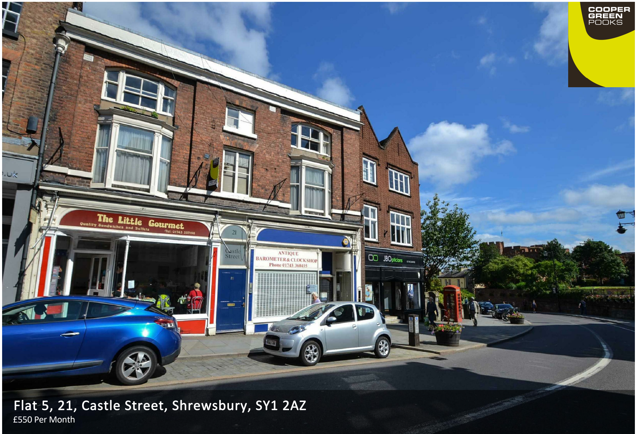
Flat 5, 21, Castle Street, Shrewsbury, SY1 2AZ £550 Per Month