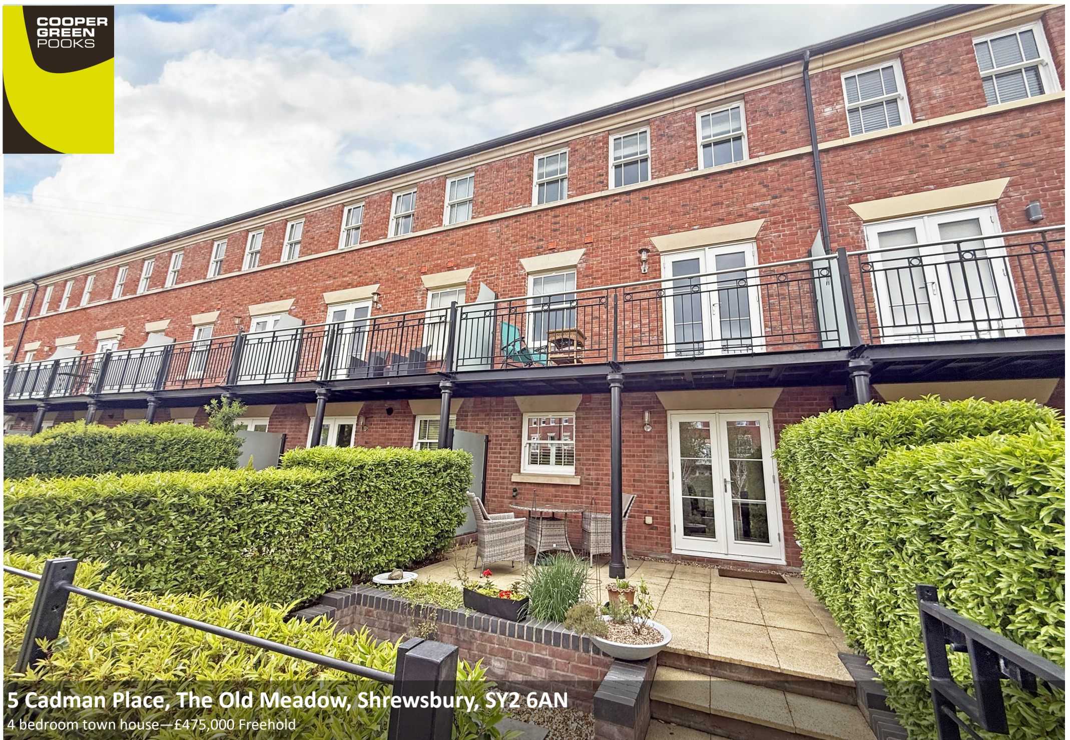
5 Cadman Place, The Old Meadow, Shrewsbury, SY2 6AN