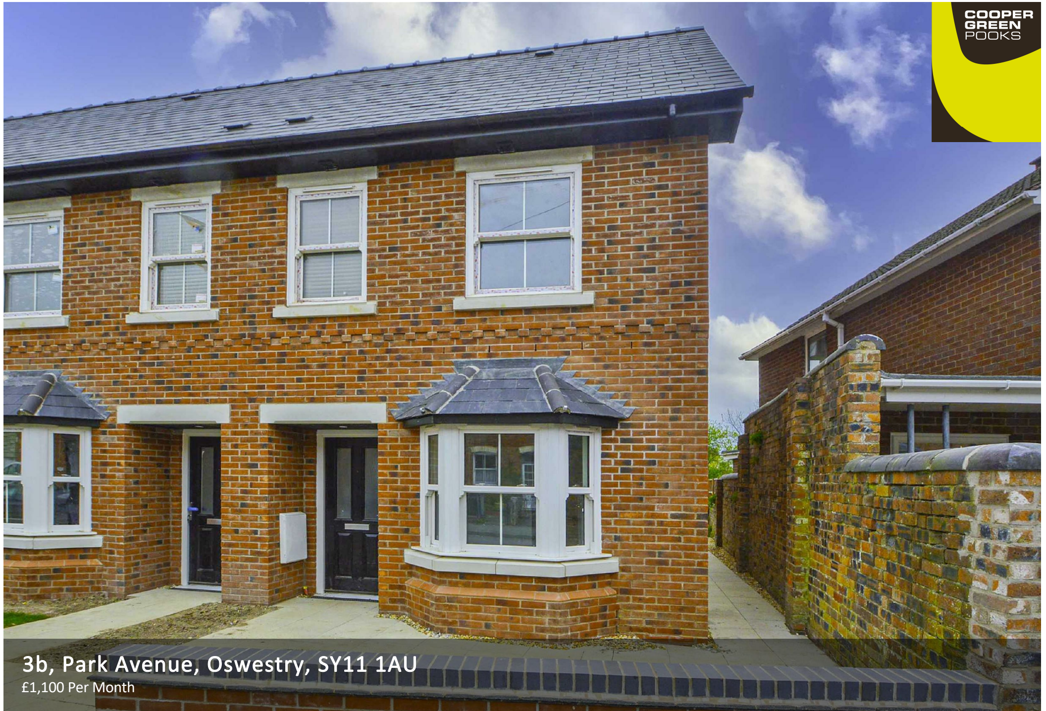
3b, Park Avenue, Oswestry, SY11 1AU £1,100 Per Month