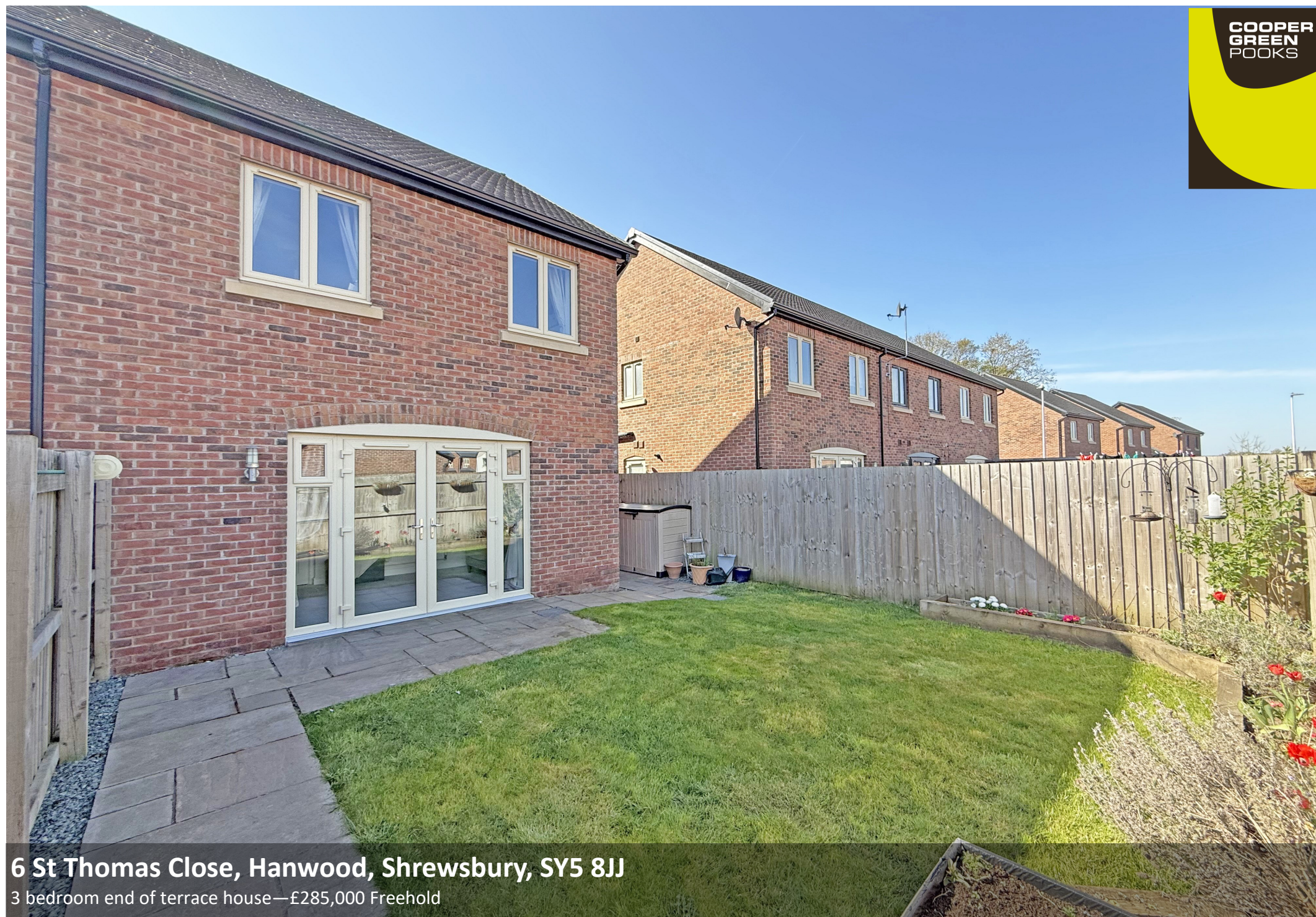
6 St Thomas Close, Hanwood, Shrewsbury, SY5 8JJ

3 bedroom end of terrace house—£285,000 Freehold