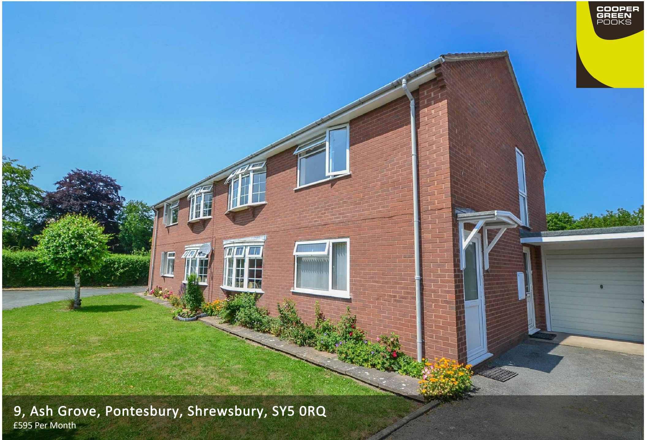
9, Ash Grove, Pontesbury, Shrewsbury, SY5 0RQ £595 Per Month