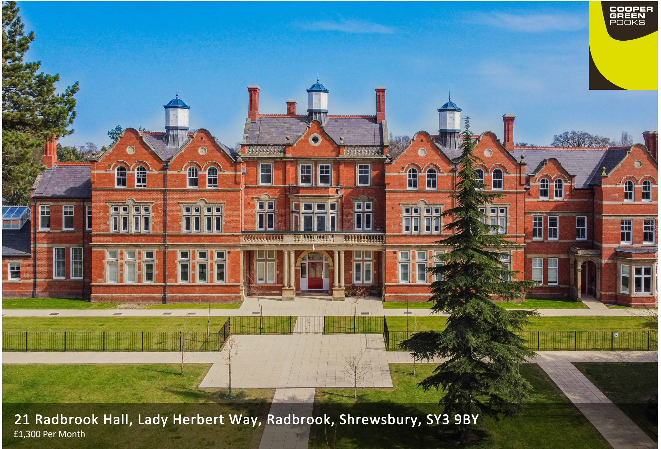
21 Radbrook Hall, Lady Herbert Way, Radbrook, Shrewsbury, SY3 9BY £1,300 Per Month