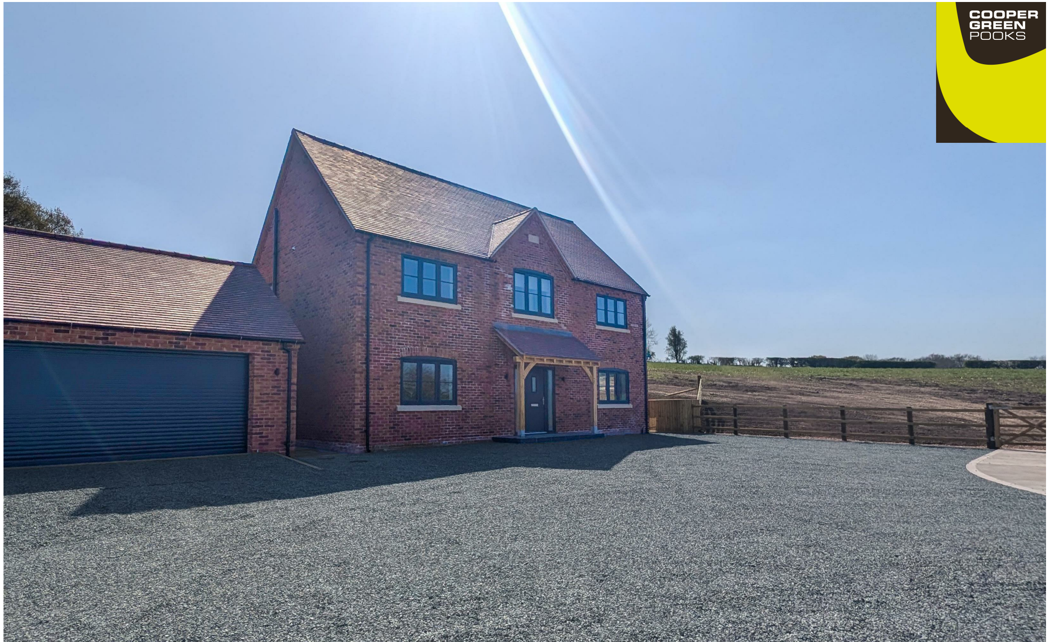
Mill Meadow House, Longden Road, Hookagate, Shrewsbury, SY5 8BA £1,750 Per Month