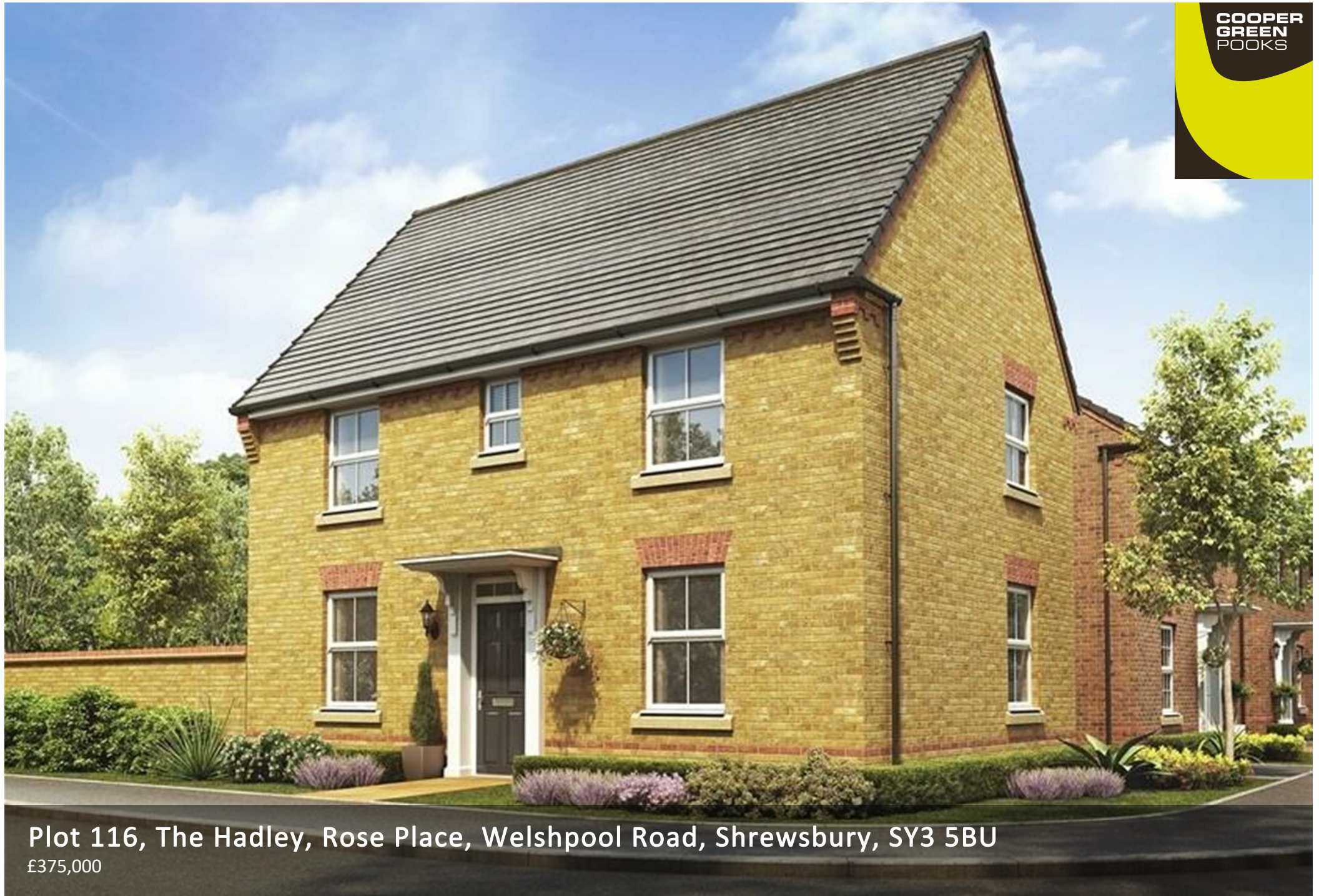
Plot 116, The Hadley, Rose Place, Welshpool Road, Shrewsbury, SY3 5BU £375,000