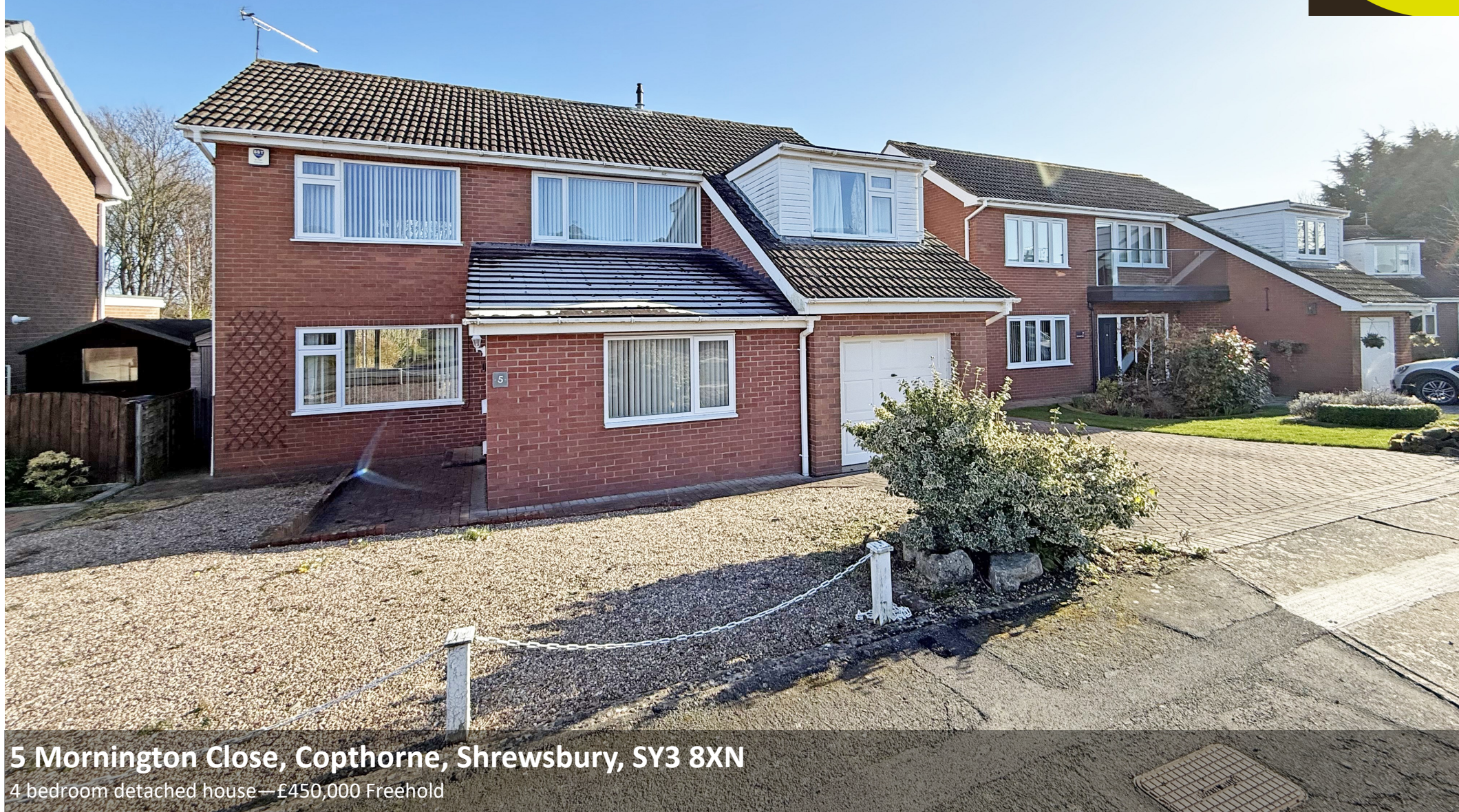
5 Mornington Close, Copthorne, Shrewsbury, SY3 8XN

4 bedroom detached house — £450,000 Freehold