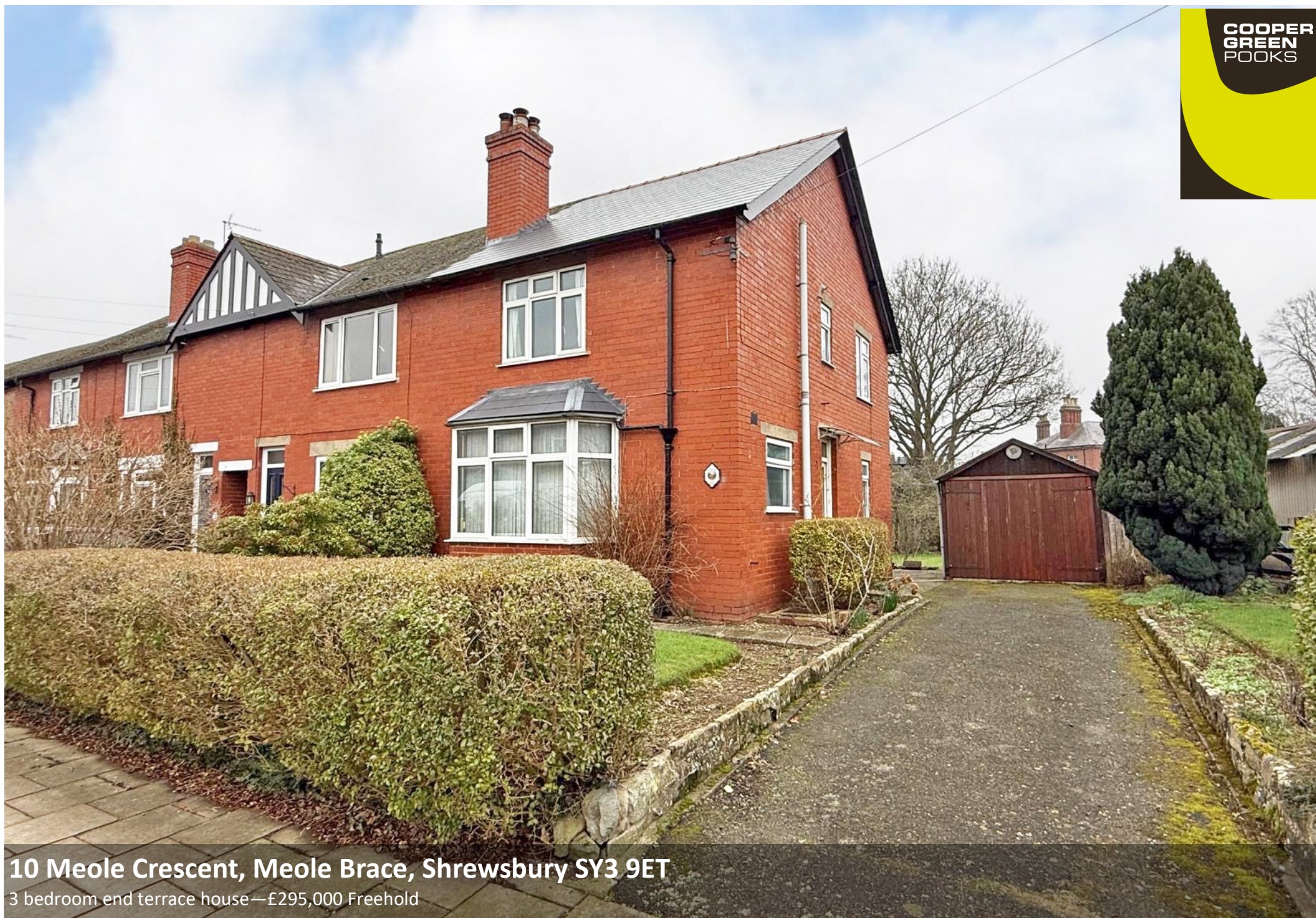
10 Meole Crescent, Meole Brace, Shrewsbury SY3 9ET

3 bedroom end terrace house—£295,000 Freehold