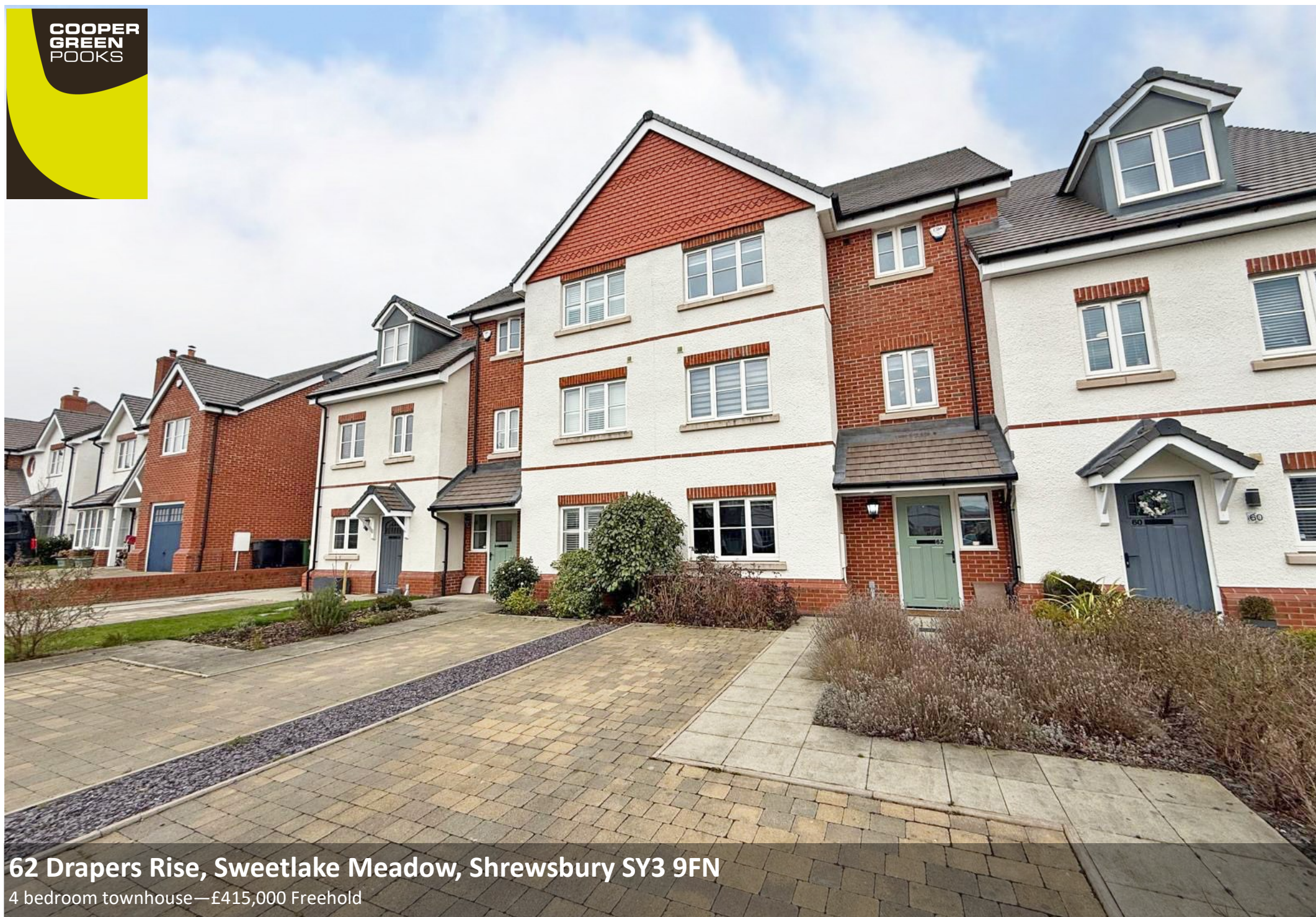
62 Drapers Rise, Sweetlake Meadow, Shrewsbury SY3 9FN