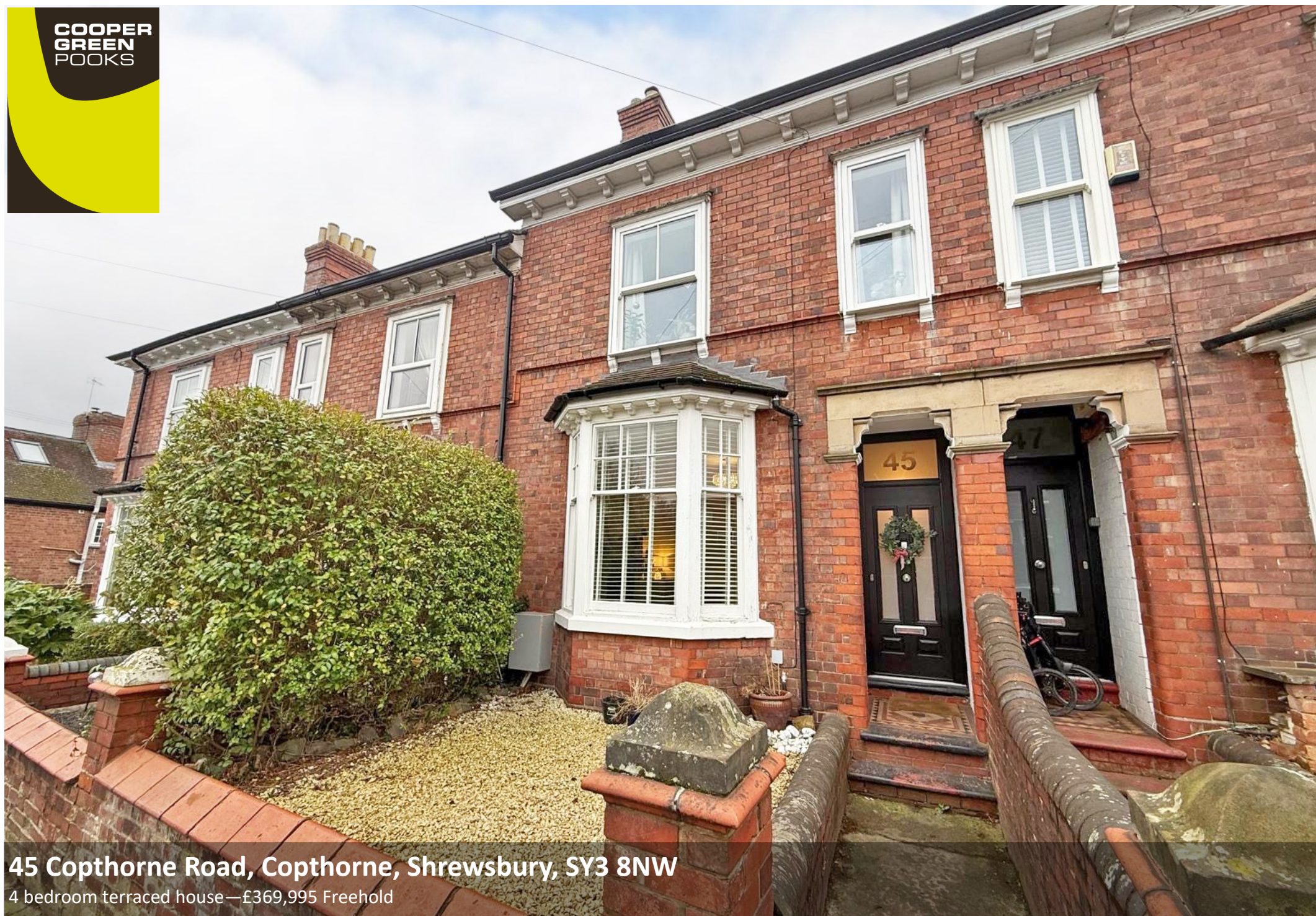
45 Copthorne Road, Copthorne, Shrewsbury, SY3 8NW

4 bedroom terraced house—£369,995 Freehold