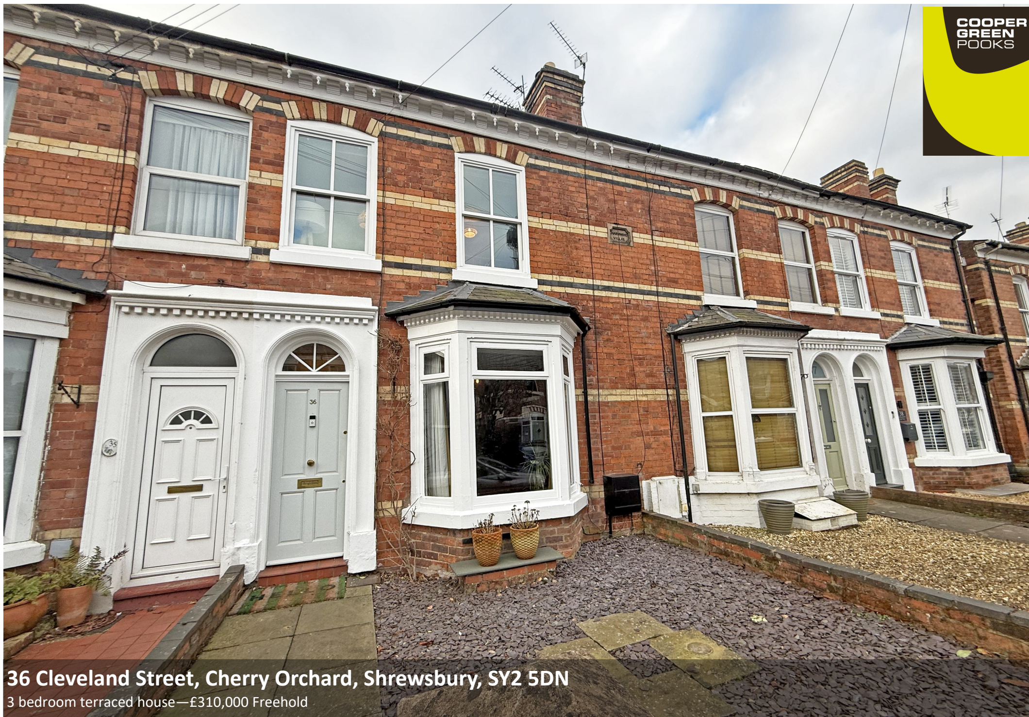
36 Cleveland Street, Cherry Orchard, Shrewsbury, SY2 5DN

3 bedroom terraced house—£310,000 Freehold