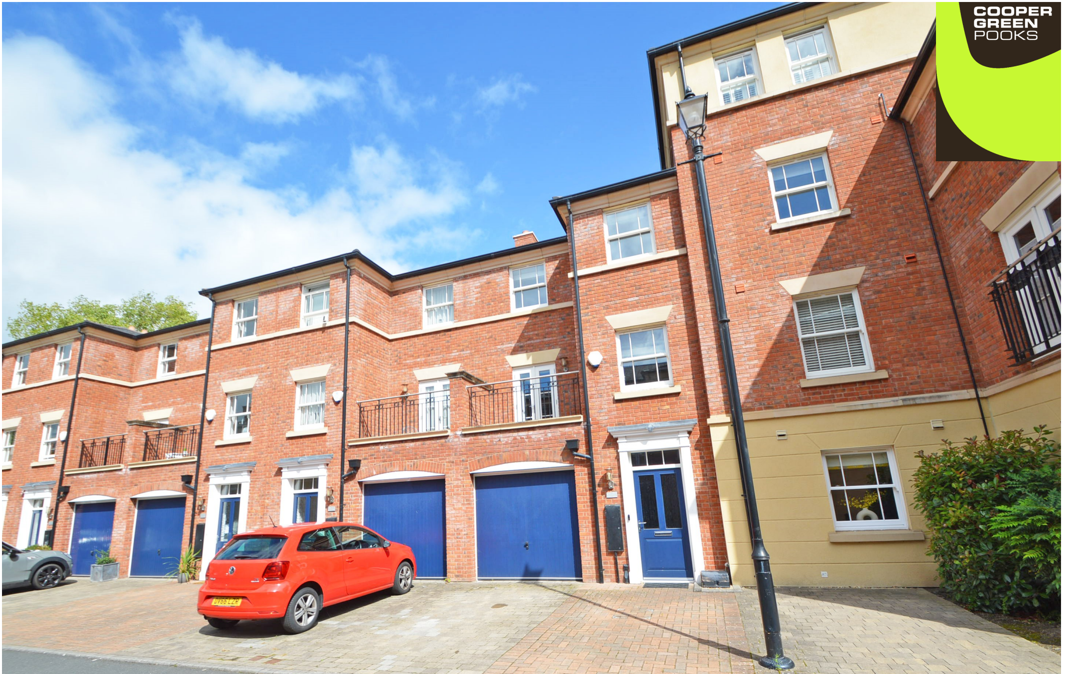
2 Cadman Place, The Old Meadow, Shrewsbury, SY2 6AN