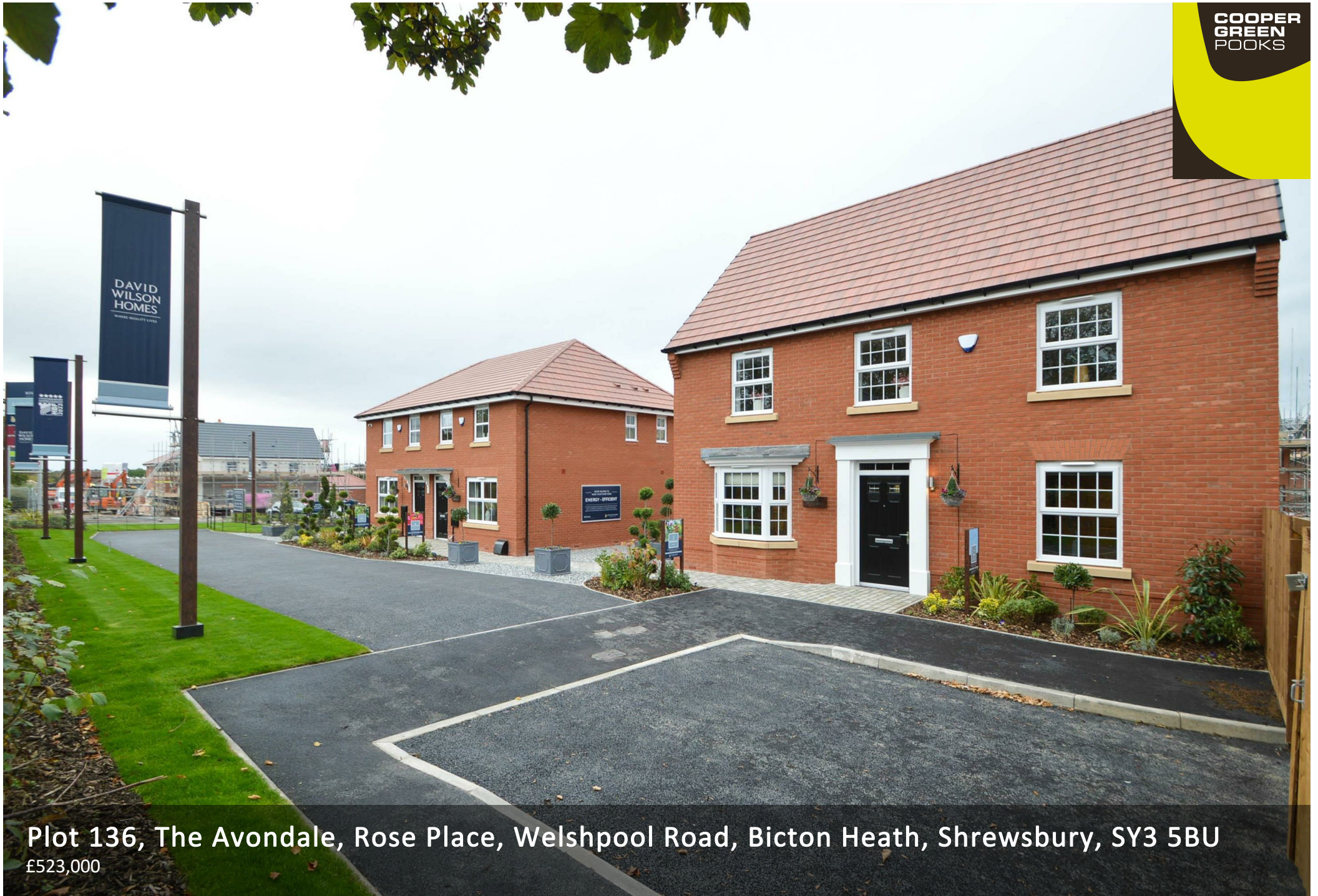
Plot 136, The Avondale, Rose Place, Welshpool Road, Bicton Heath, Shrewsbury, SY3 5BU £523,000