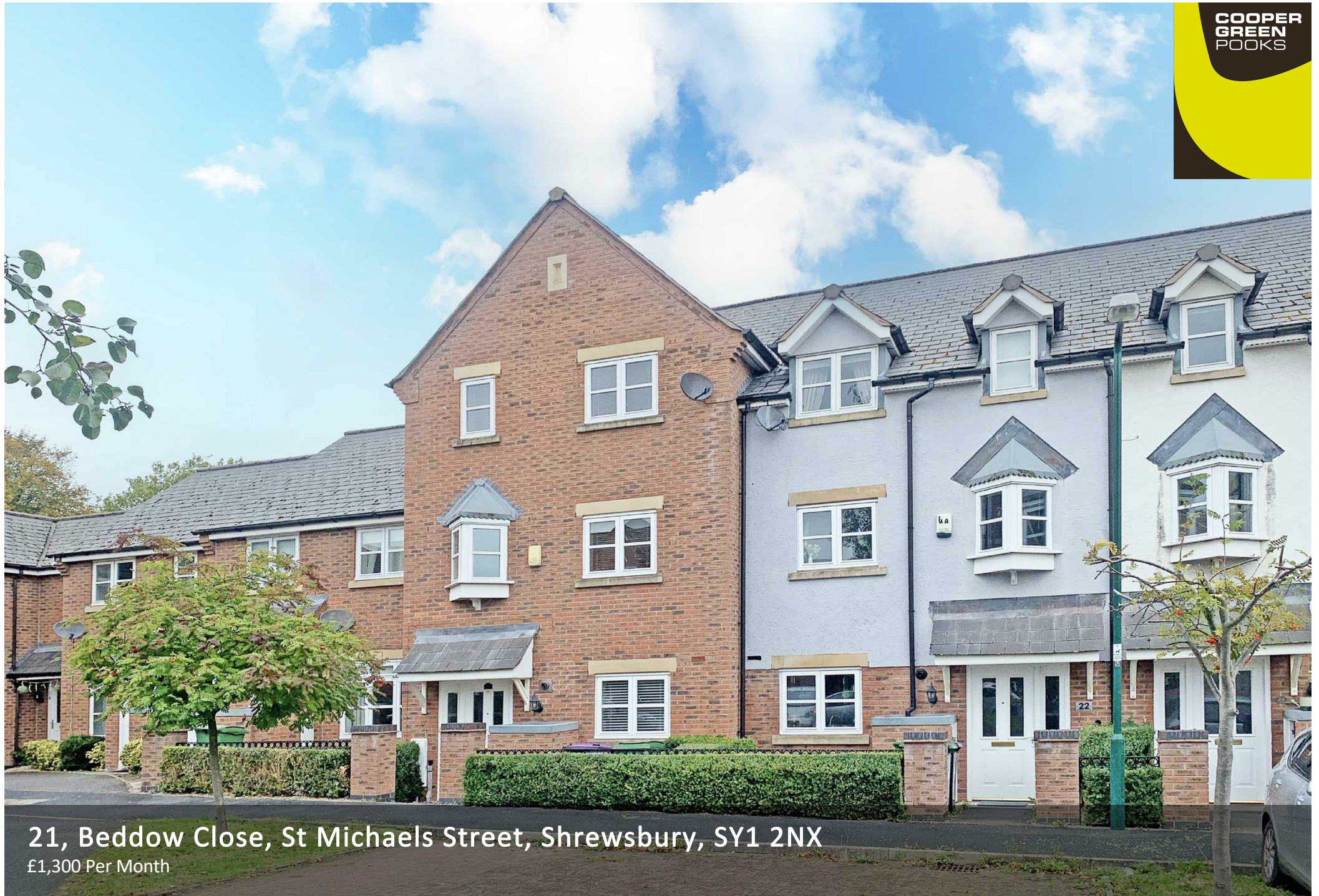
21, Beddow Close, St Michaels Street, Shrewsbury, SY1 2NX £1,300 Per Month