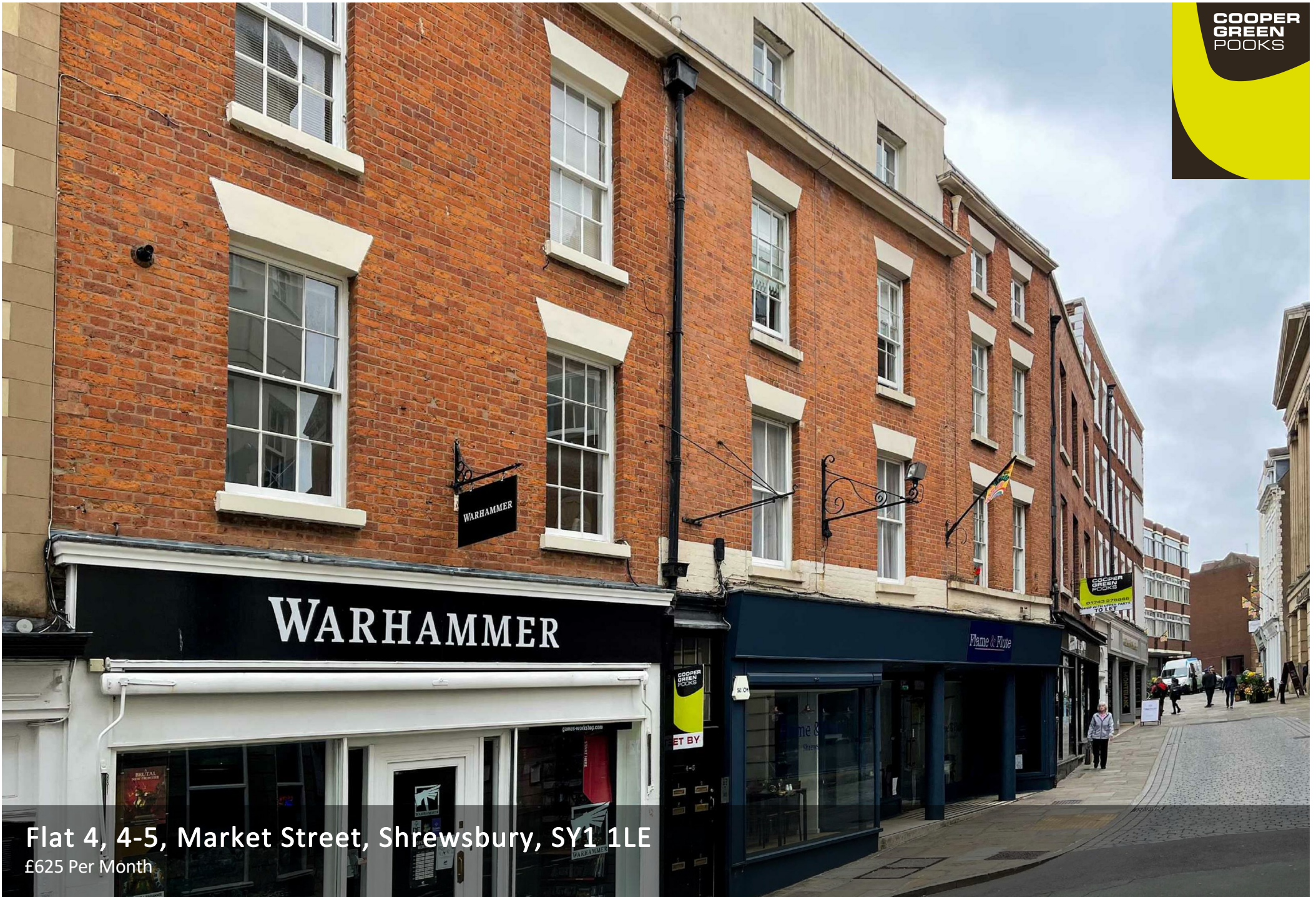
Flat 4, 4-5, Market Street, Shrewsbury, SY1 1LE £625 Per Month