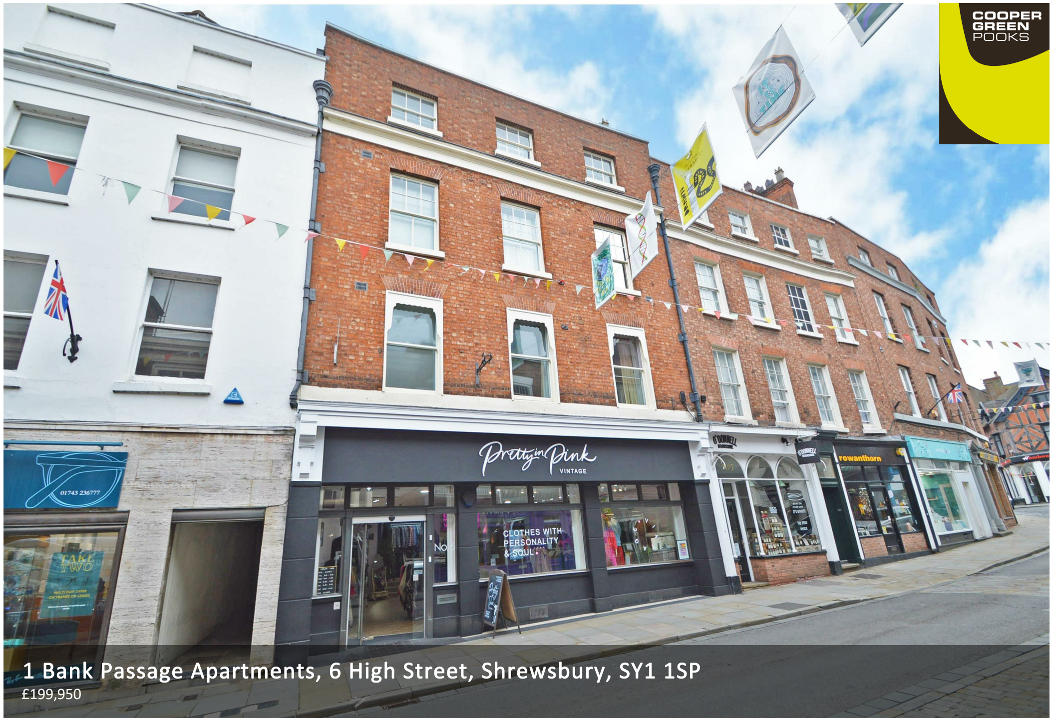
1 Bank Passage Apartments, 6 High Street, Shrewsbury, SY1 1SP £199,950