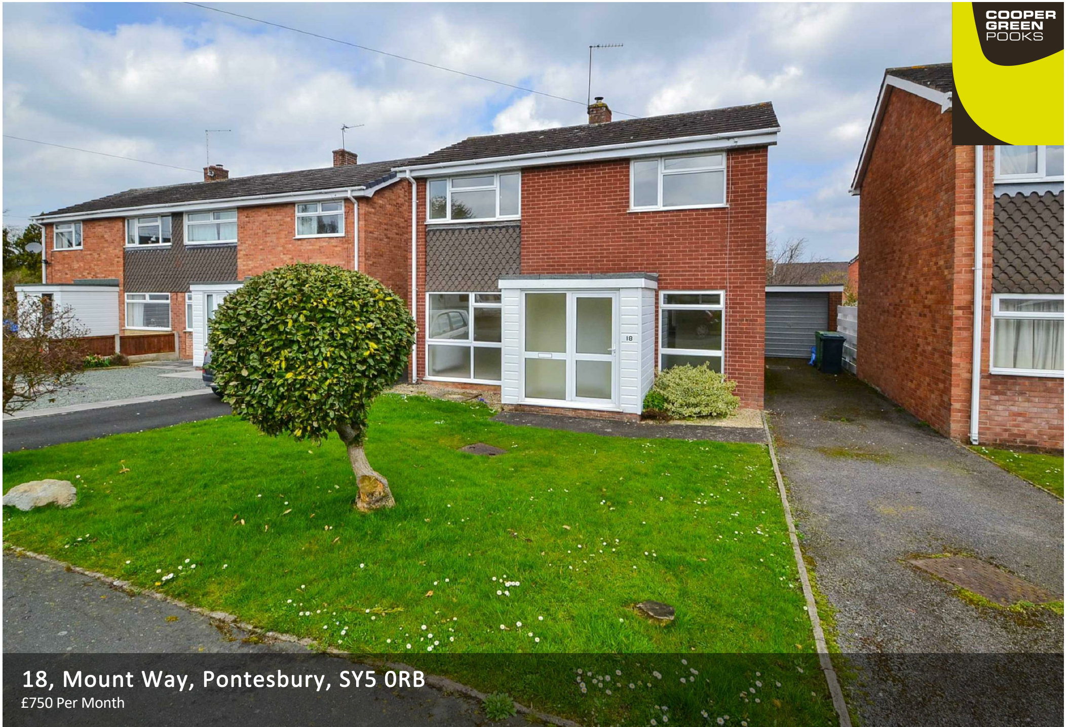
18, Mount Way, Pontesbury, SY5 0RB £750 Per Month