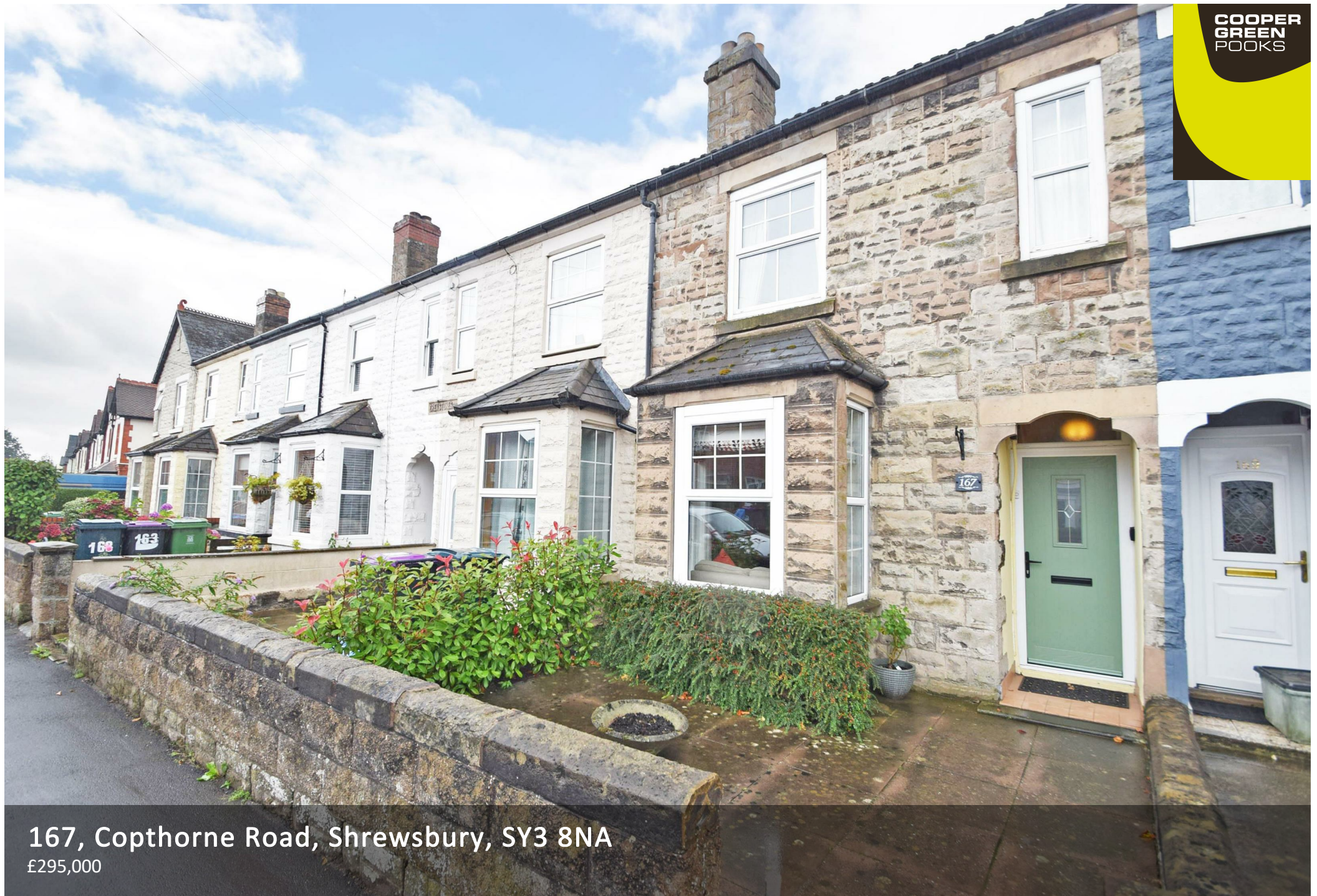
167, Copthorne Road, Shrewsbury, SY3 8NA £295,000