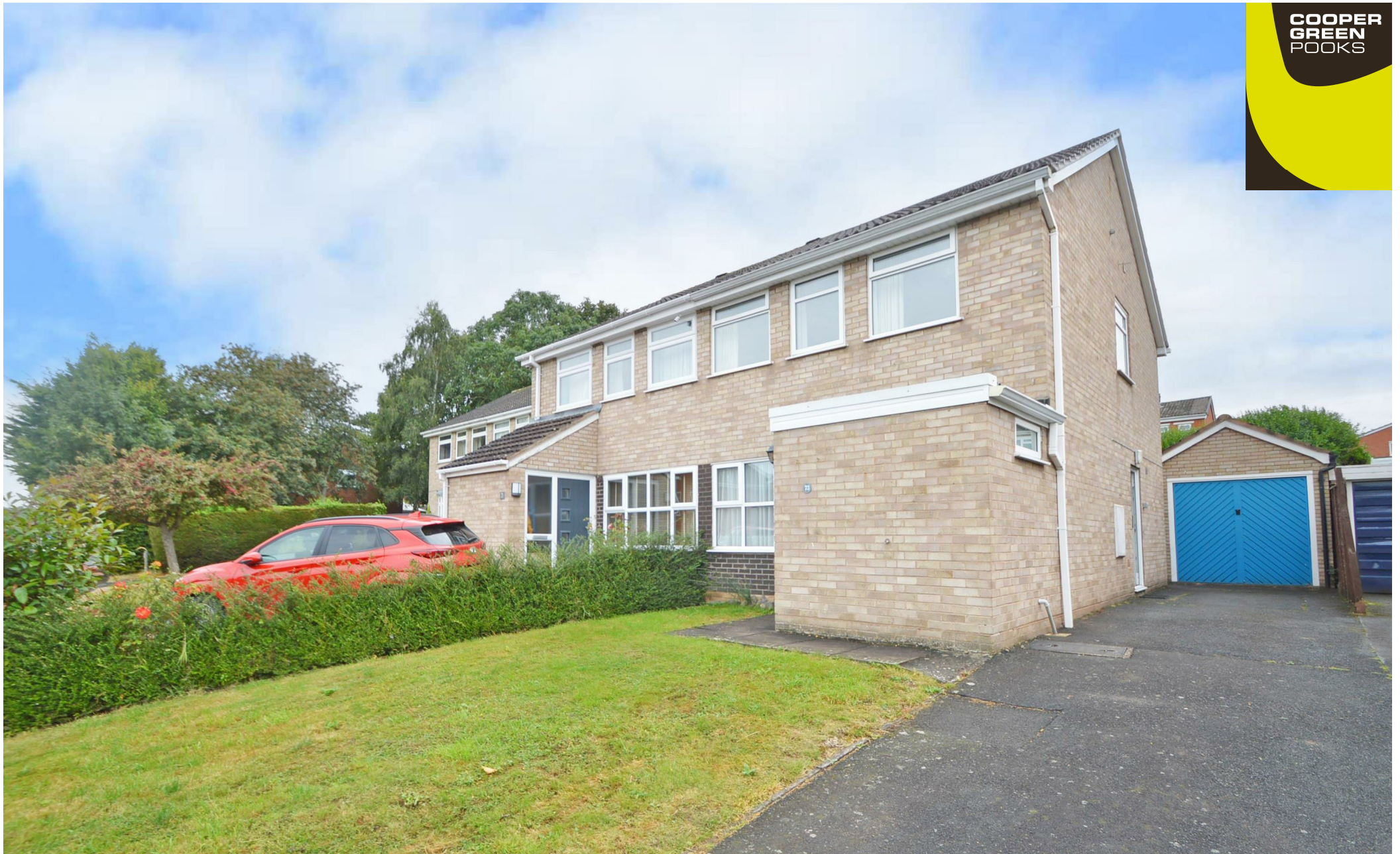
73, Tudor Road, The Farthings, Shrewsbury, SY2 6TB £259,000