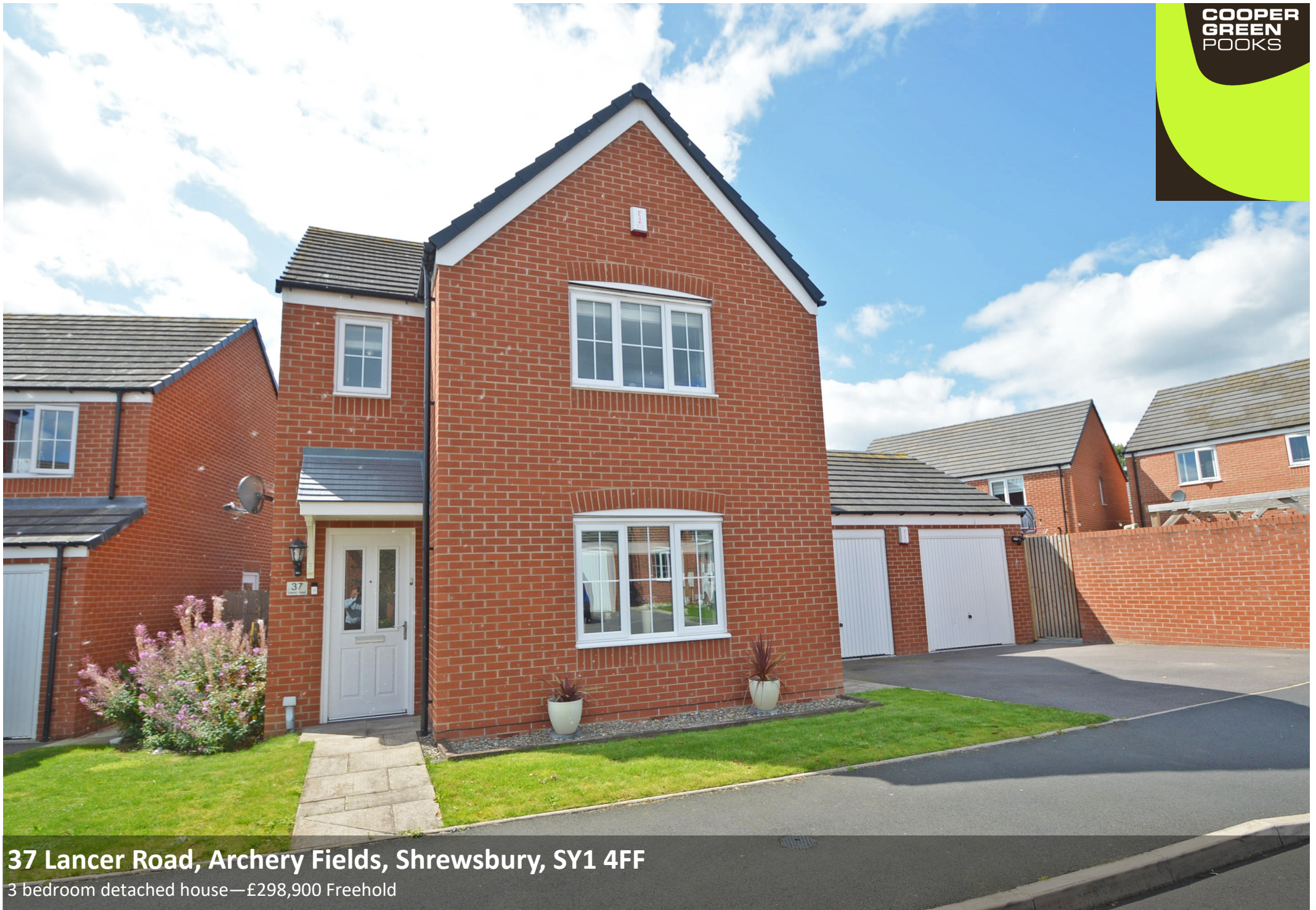
37 Lancer Road, Archery Fields, Shrewsbury, SY1 4FF

3 bedroom detached house — £298,900 Freehold