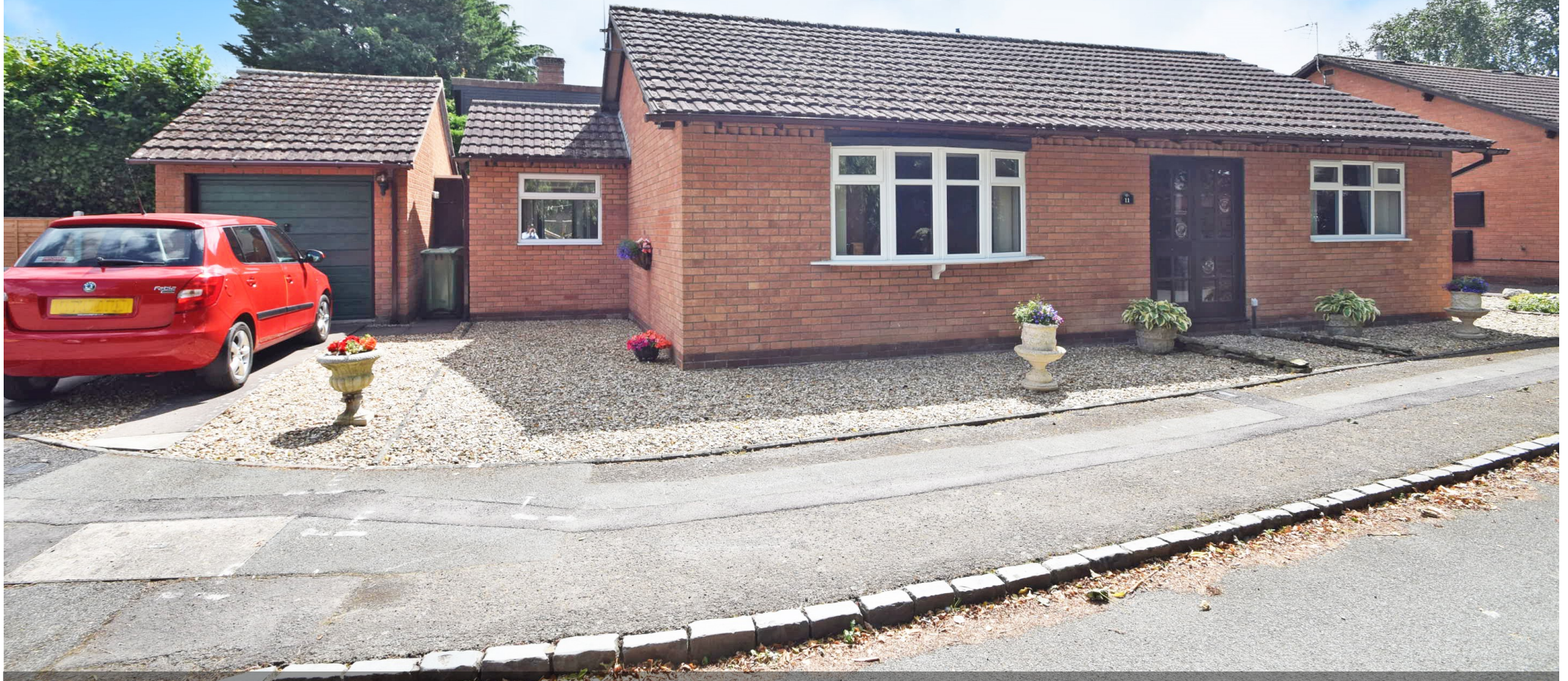
11 Thorns Grove, Bicton Heath, Shrewsbury, SY3 5BY

2 bedroom detached bungalow — £318,500 Freehold