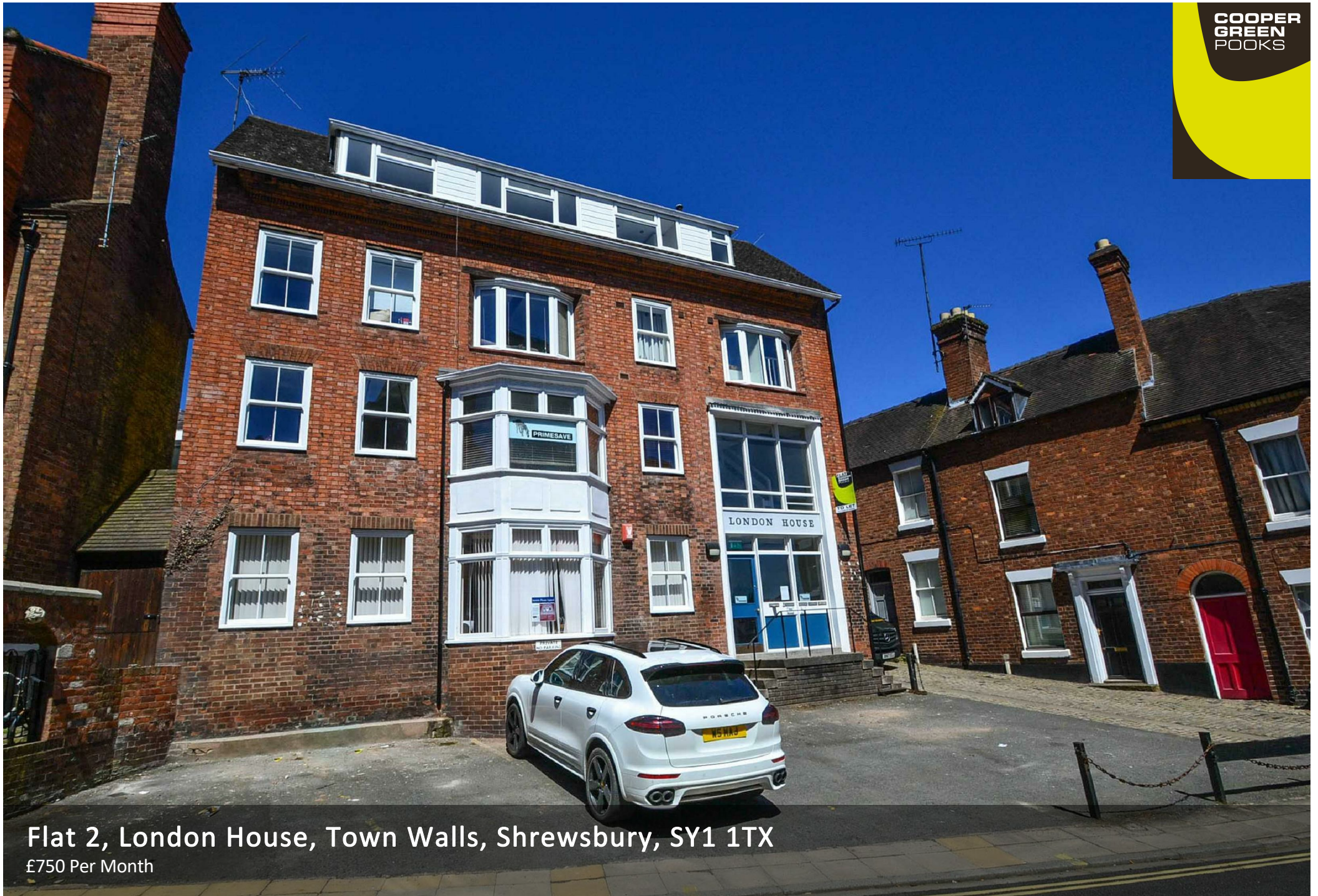
Flat 2, London House, Town Walls, Shrewsbury, SY1 1TX £750 Per Month