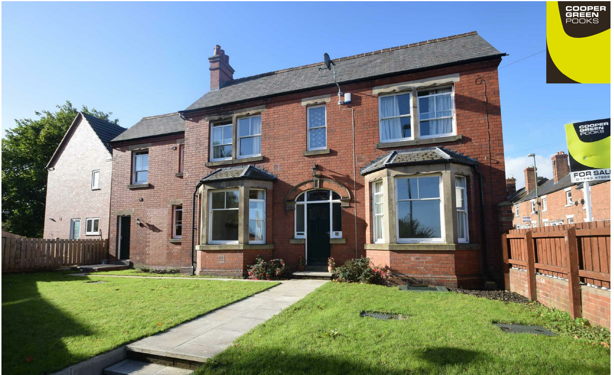
Primrose Villa, 93, St Michaels Street, Shrewsbury, SY1 2HE £975 Per Month