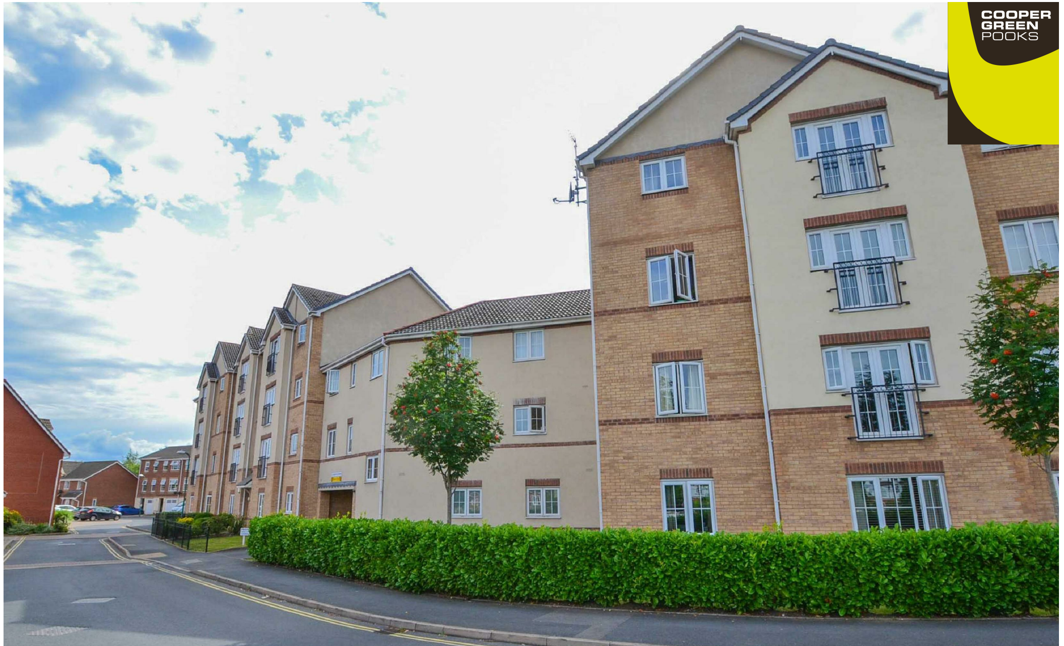
40, Greenfields Gardens, Greenfields, Shrewsbury, SY1 2RN £800 Per Month