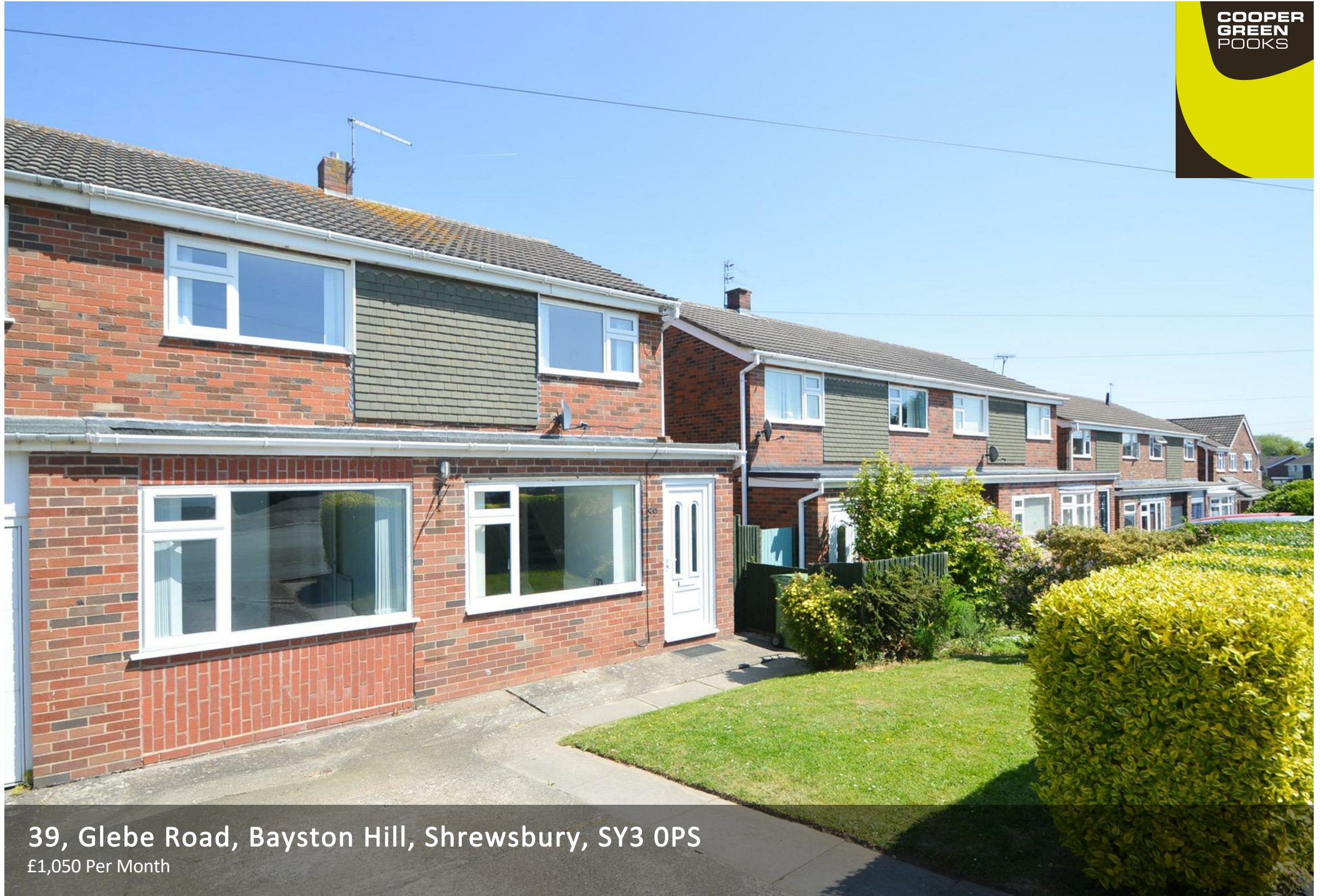
39, Glebe Road, Bayston Hill, Shrewsbury, SY3 0PS £1,050 Per Month