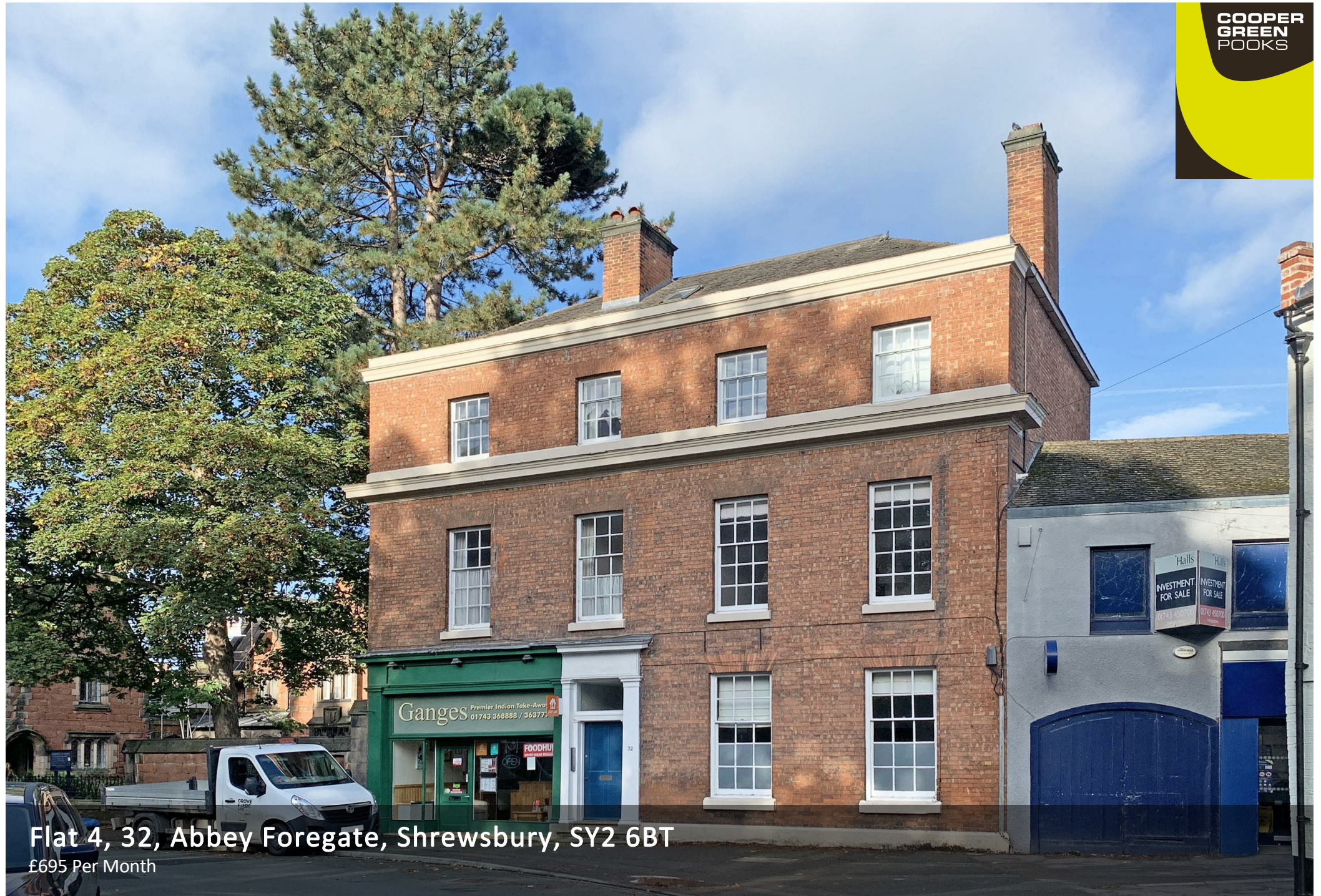
Flat 4, 32, Abbey Foregate, Shrewsbury, SY2 6BT £695 Per Month