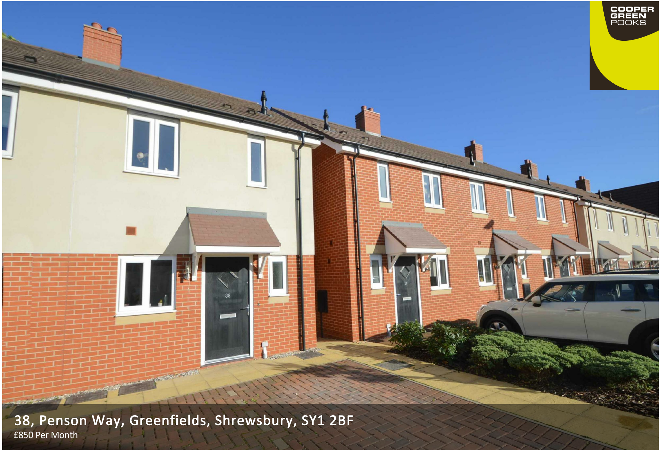
38, Penson Way, Greenfields, Shrewsbury, SY1 2BF £850 Per Month