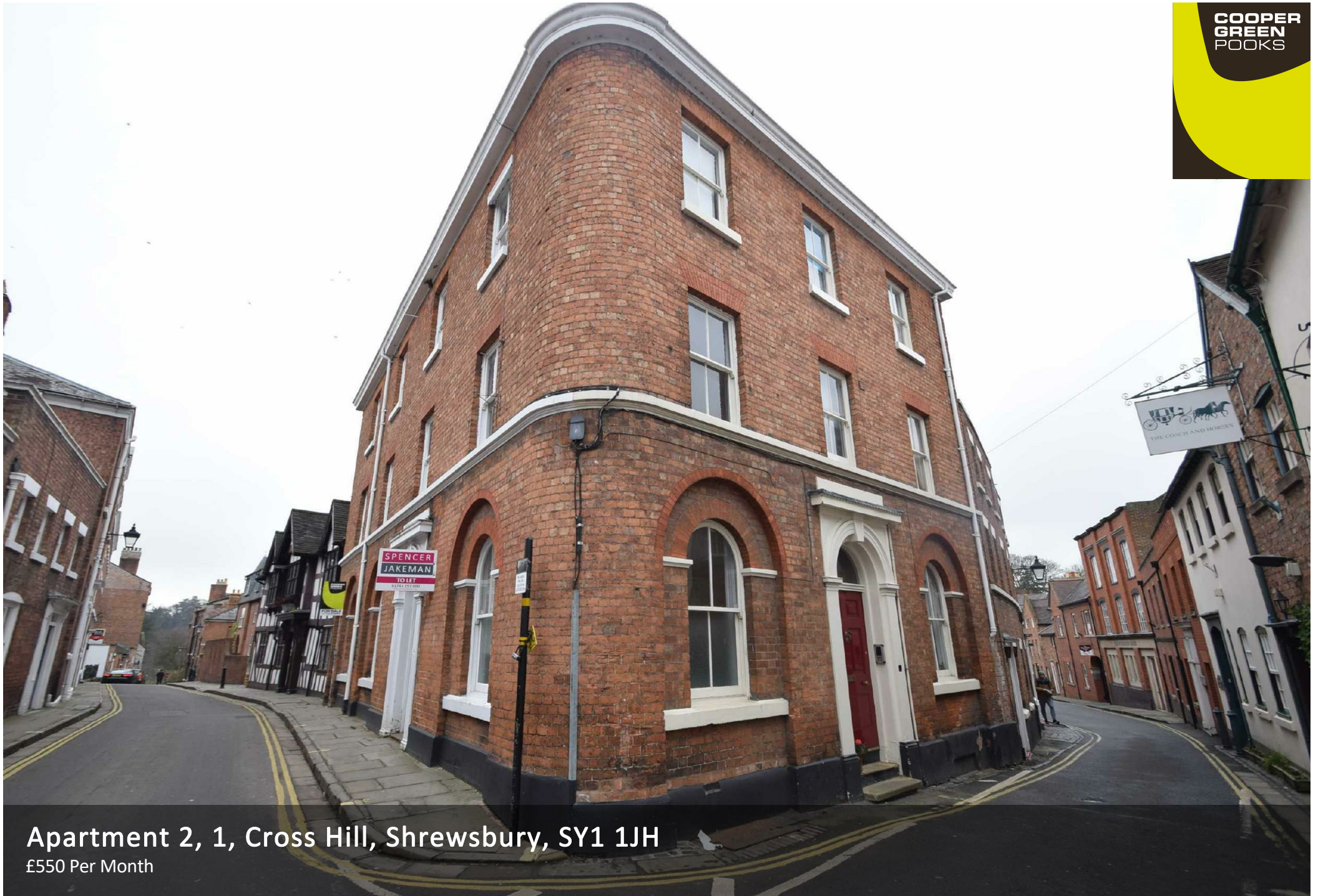
Apartment 2, 1, Cross Hill, Shrewsbury, SY1 1JH £550 Per Month