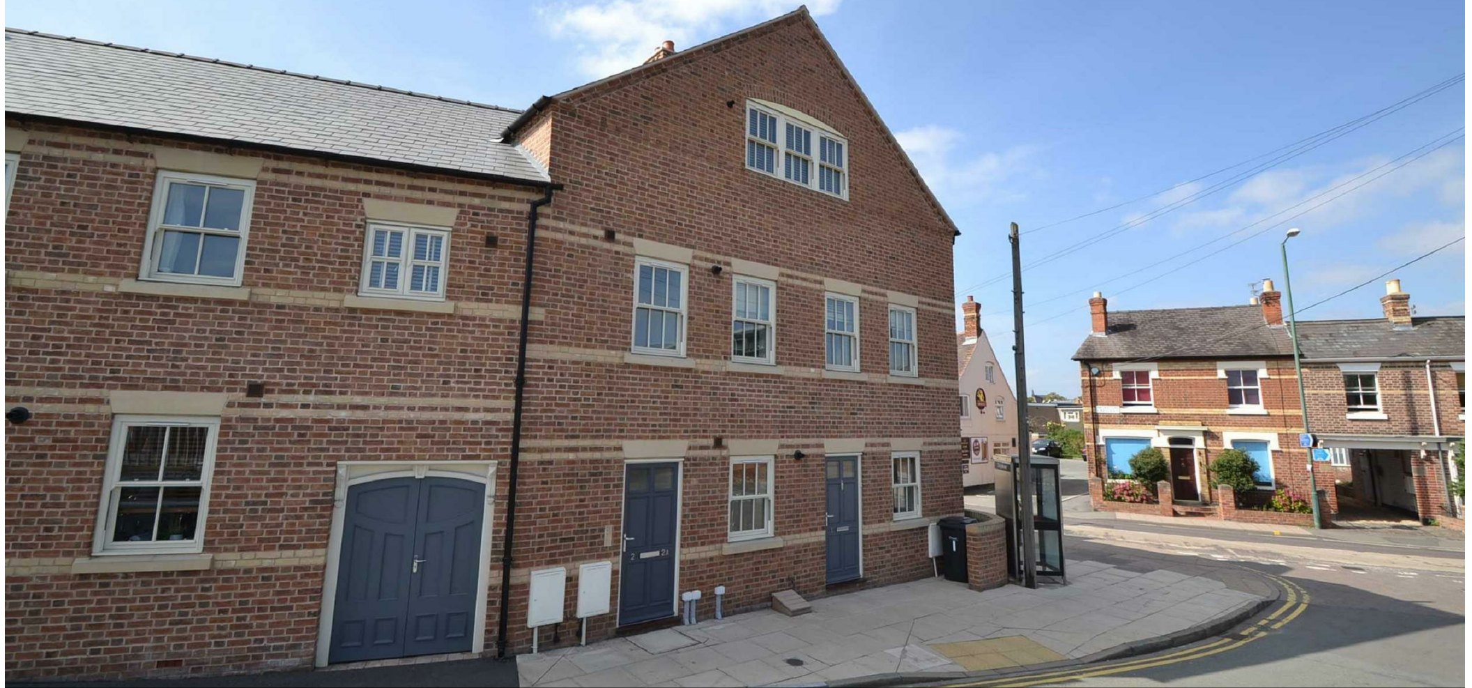
2, Betton Street, Belle Vue, Shrewsbury, SY3 7NY £1,050 Per Month