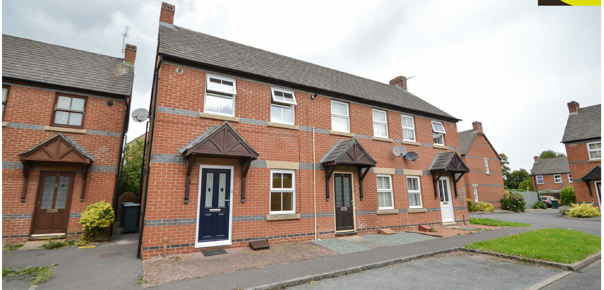
32, Glendower Court, Greenfields, Shrewsbury, SY1 2RG £800 Per Month