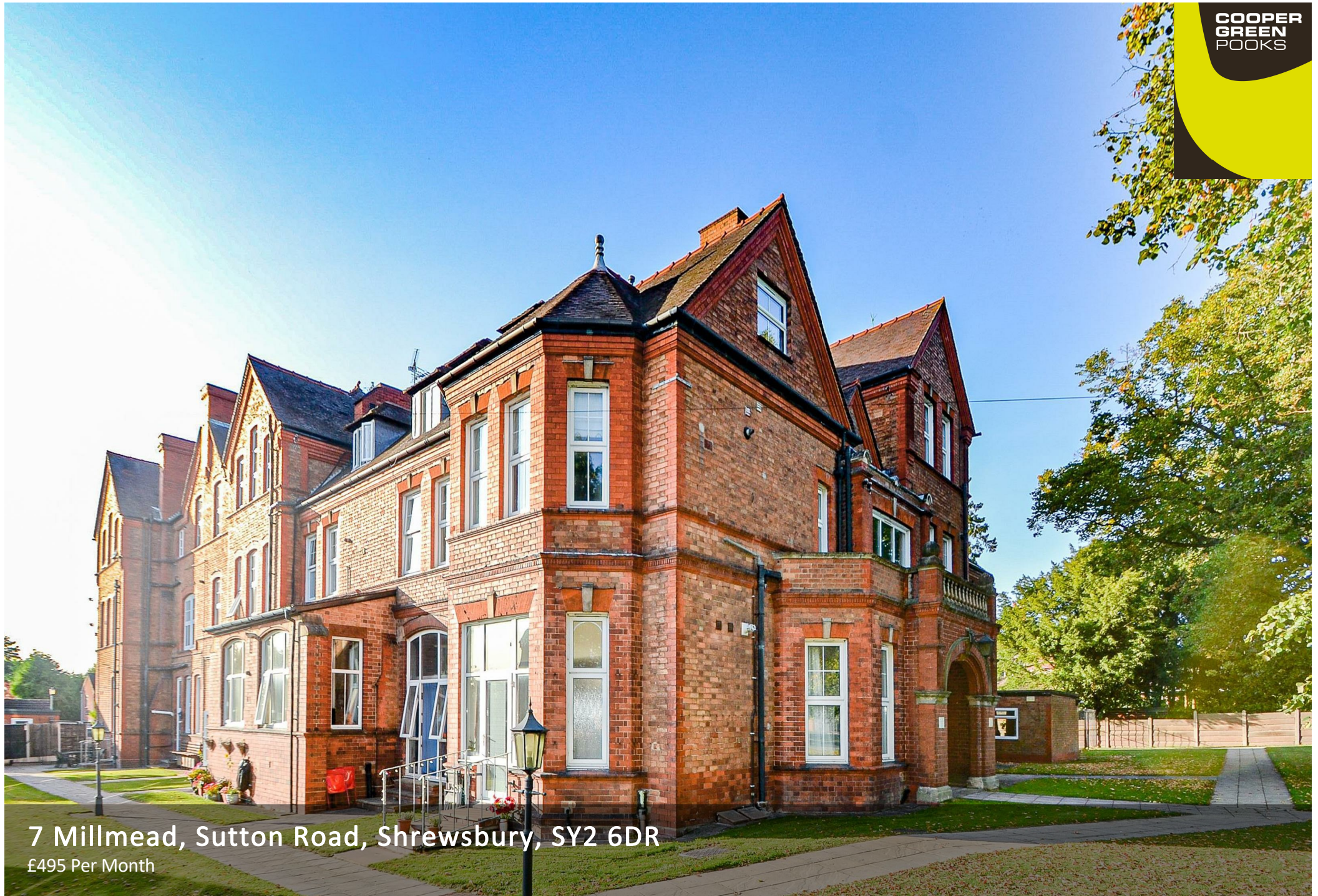
7 Millmead, Sutton Road, Shrewsbury, SY2 6DR £495 Per Month